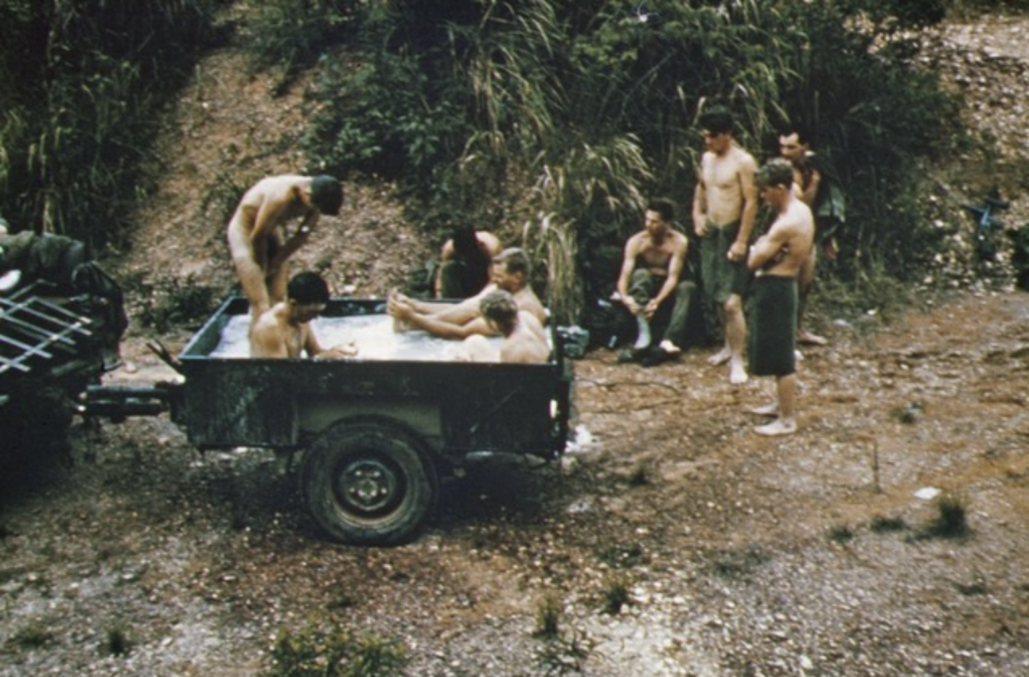
Malaya. c. 1960. Unidentified members of B Company, 1st Battalion, The Royal Australian Regiment (1RAR), bathing naked in a dobie (improvised bath) after returning from a military exercise near the border with Thailand. The dobie in this case is a Landrover trailer lined with canvas.