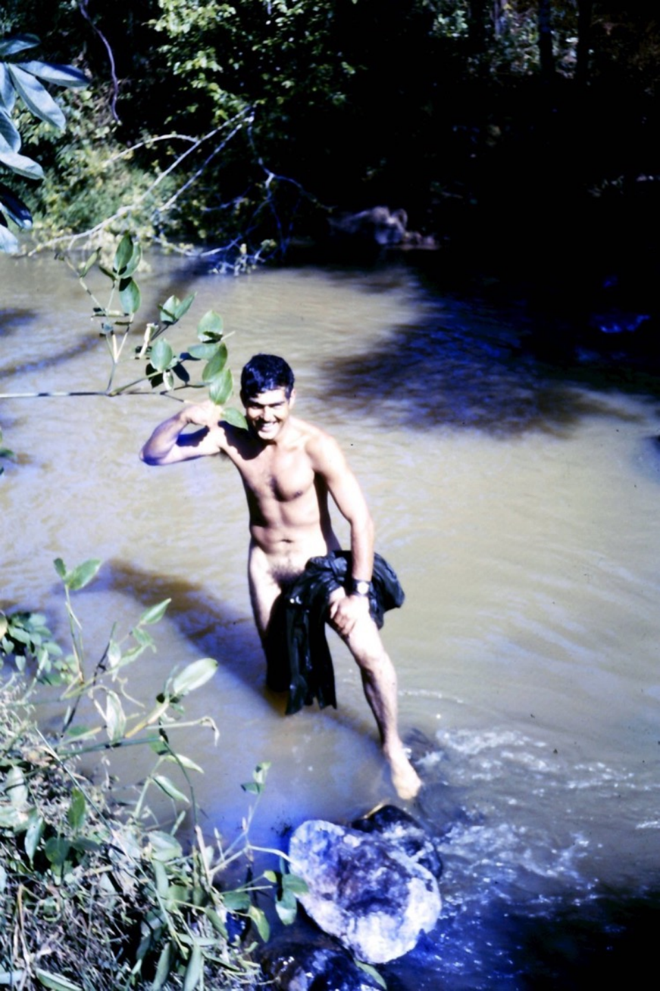
Creek Swim. [1968]