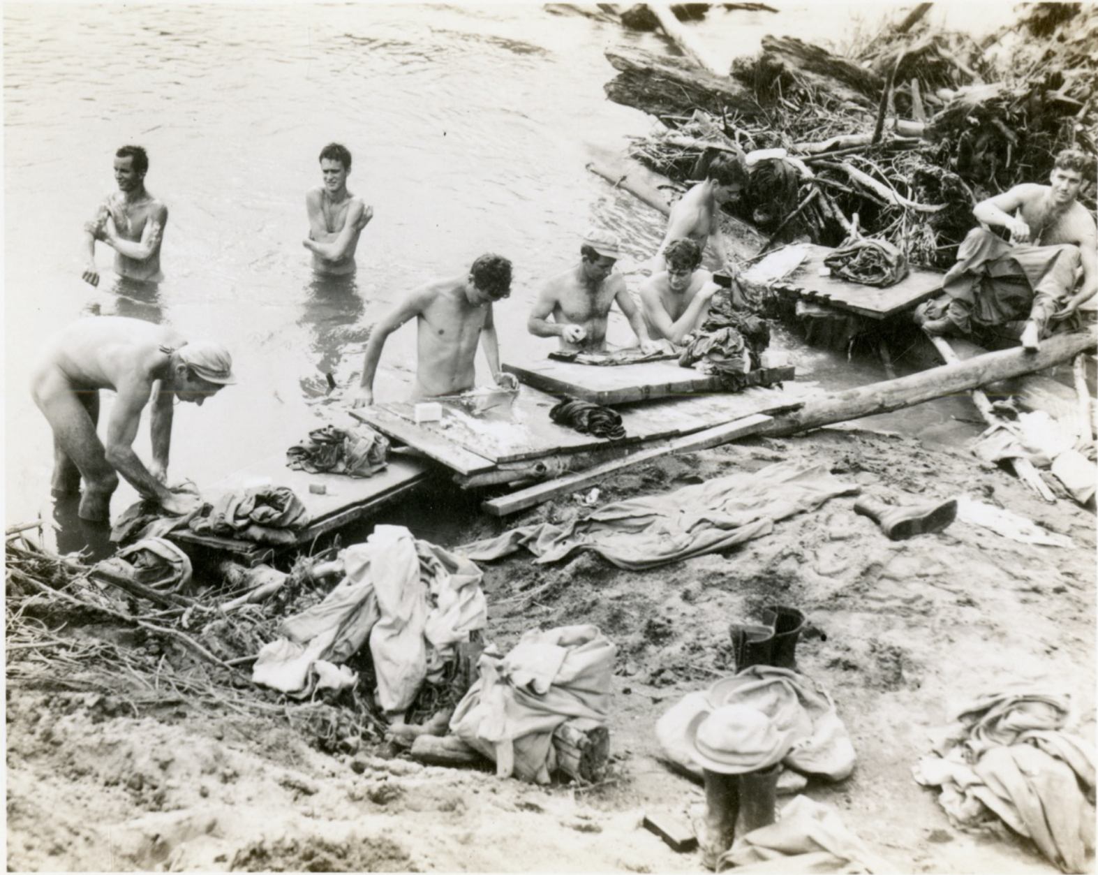
Diggers bathing and washing their clothes in a body of water.