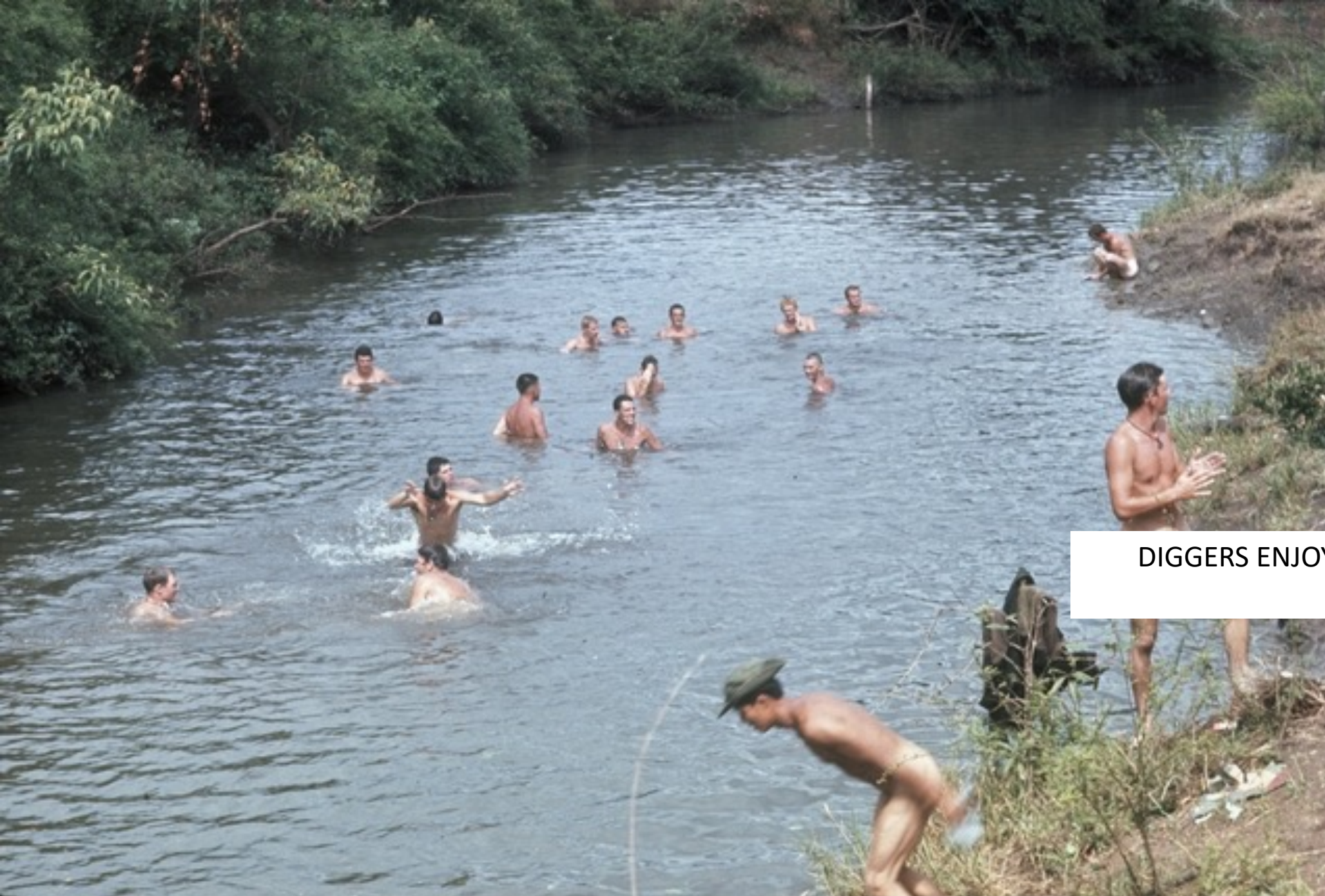
DIGGERS ENJOYED SWIMMING IN LOCAL RIVER.