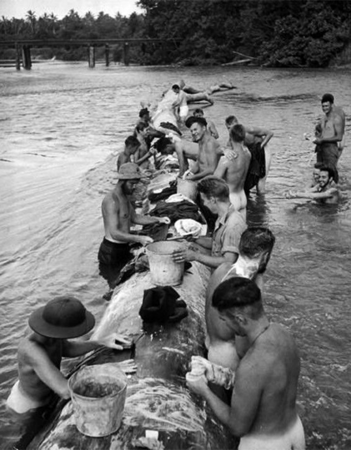
WASHING CLOTHES IN RIVER