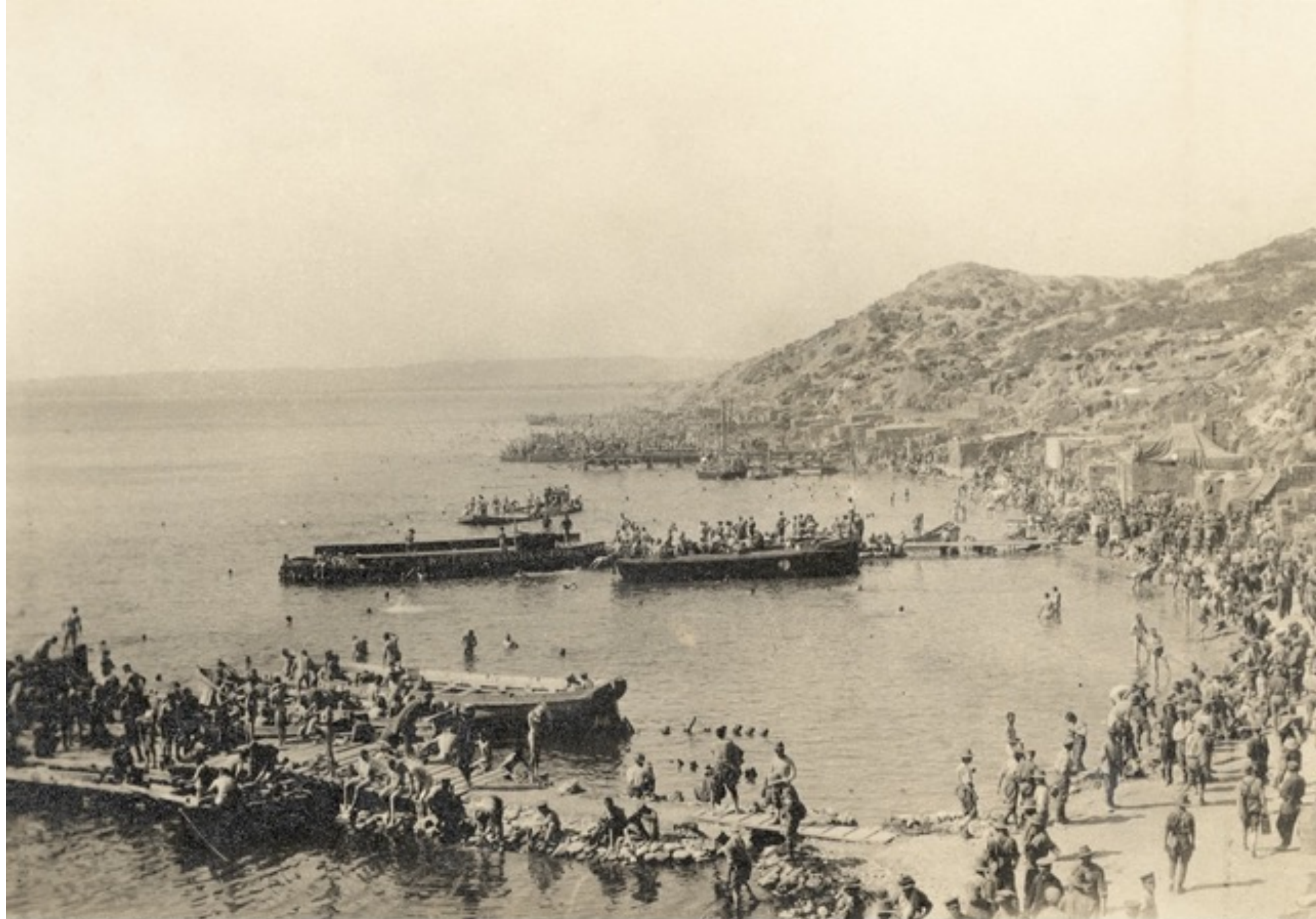
AUSTRALIAN WAR MEMORIAL