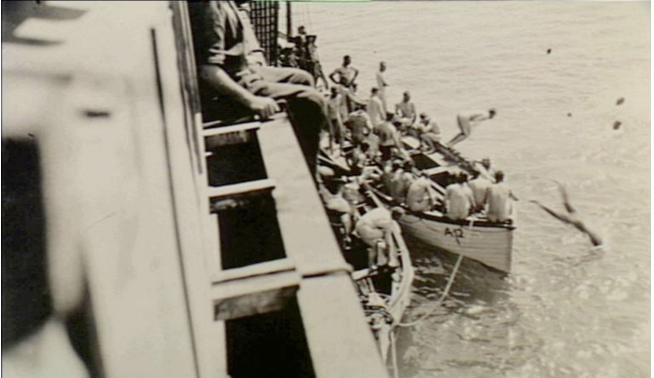
Soldiers, most of them stark naked, dive from lifeboats or landing boats into the waters of the Mediterranean for a swim in Mudros Harbour. The boats are tethered to the side of a troopship (left). 1915.