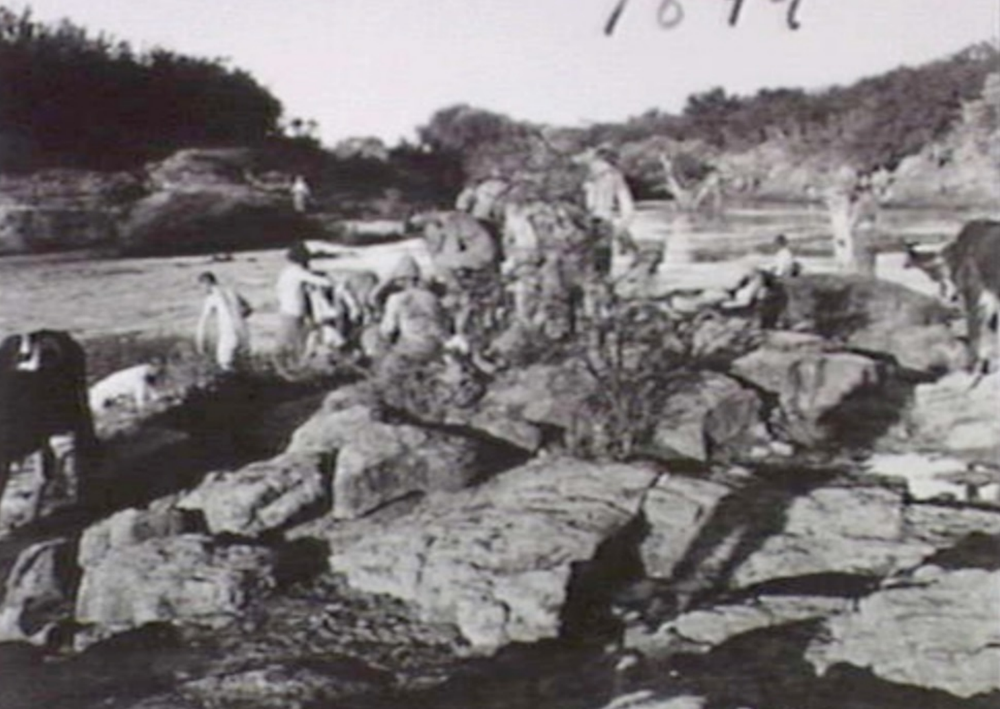
1899, (Boer War) SOUTH AFRICA MEMBERS OF THE 1ST SCOTS GUARDS SWIMMING IN A RIVER.

Relieving the 1st Scots Guard. South Africa 1899