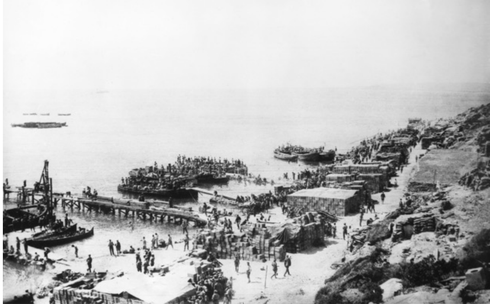
AUSTRALIAN WAR MEMORIAL