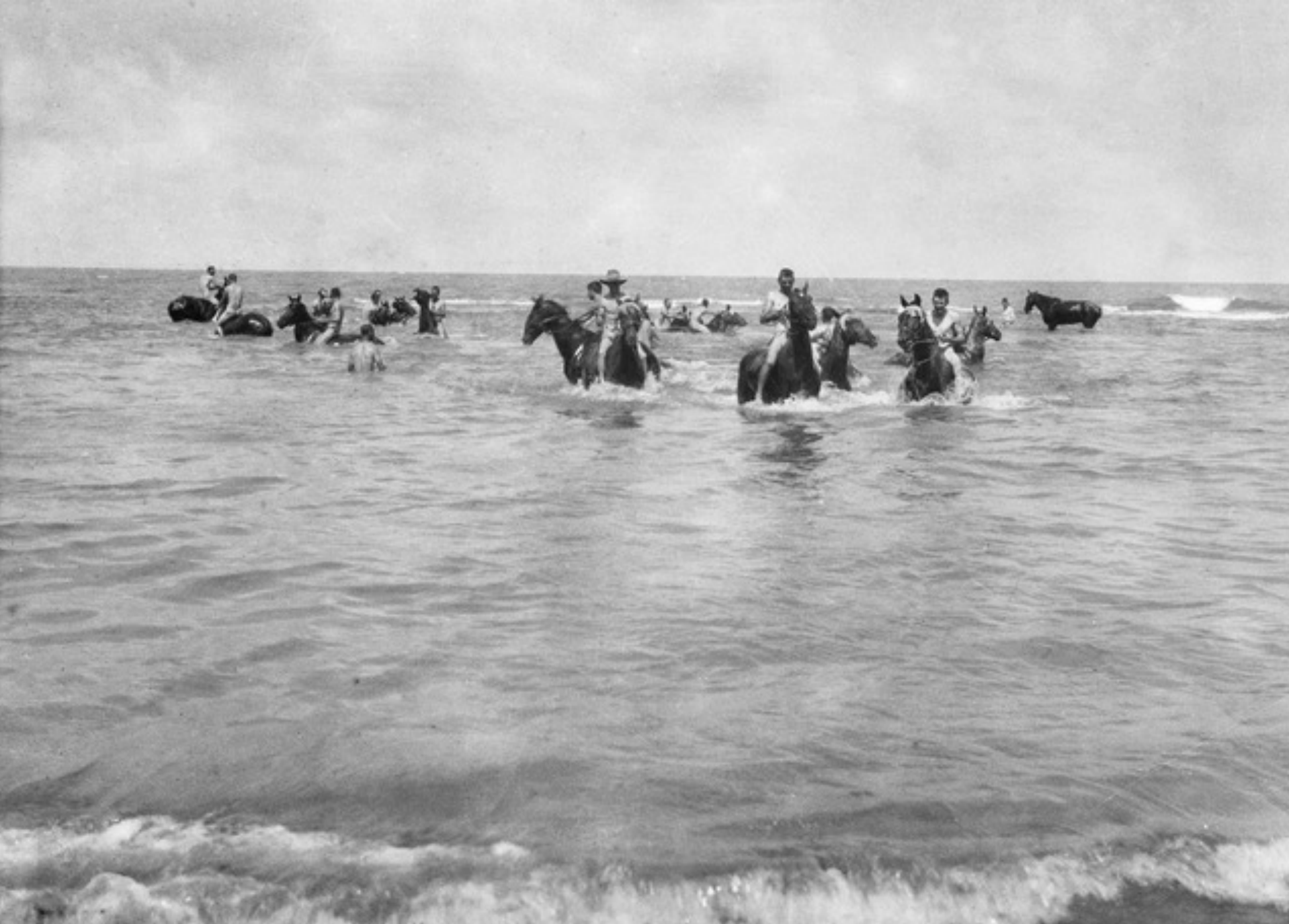
MEN OF THE 15TH AUSTRALIAN LIGHT HORSE REGIMENT SWIMMING THEIR HORSES AT JAFFA, PALESTINE.