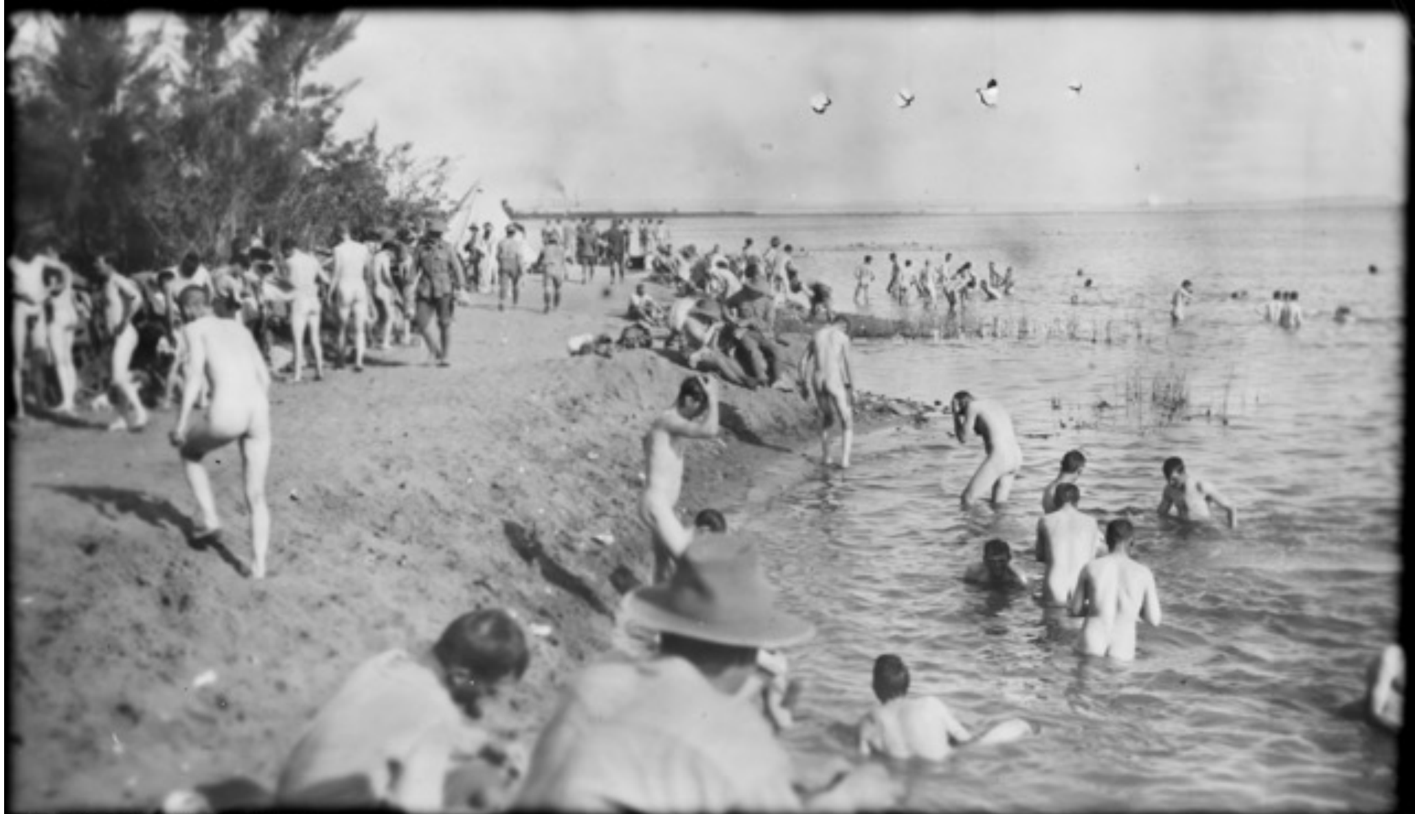
AUSTRALIAN WAR MEMORIAL