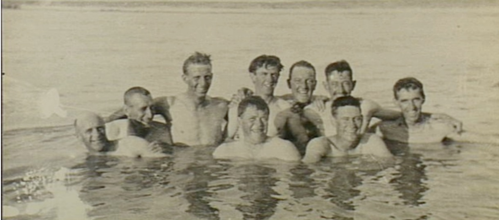
Sahiliyeh, Mesopotamia. 1918-03. Informal portrait of members of No. 3 Station, 1st Wireless Signal Squadron, Mesopotamian Expeditionary Force, enjoying an afternoon swim in the Euphrates River.