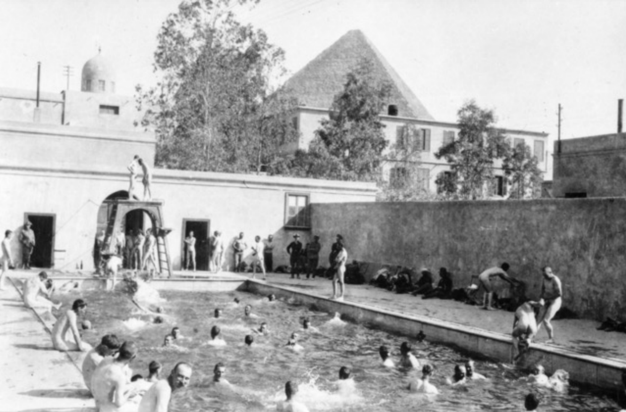
Mena, Egypt. c. 1915. Members of the 8th Australian Light Horse Regiment relaxing in a swimming pool.