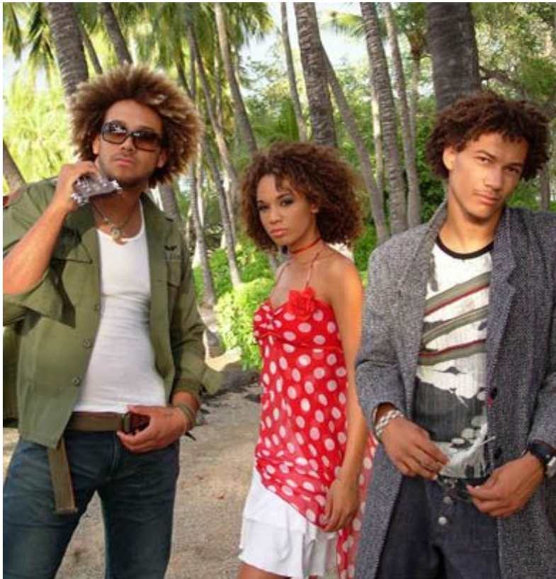
Photo to Left: The so-called Christian Hip Hop group, Souljahz . If you saw these three people walking down the street, would you think they were Christians? No way! Their faces and appearance are worldly.