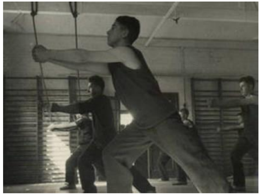
Inmates making use of the camp's gym

In 1943 it became clear that the Allies were slowly winning, British airmen were moved to a separate camp and secretly freed, while 20 Germans were allowed to rent residences in Dublin and attend the local colleges. All remaining German prisoners were repatriated after the war, ending the history of what might well have been history's strangest, and possibly most comfortable, POW camp.