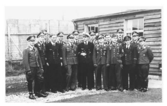
Some of the camp's German inhabitants