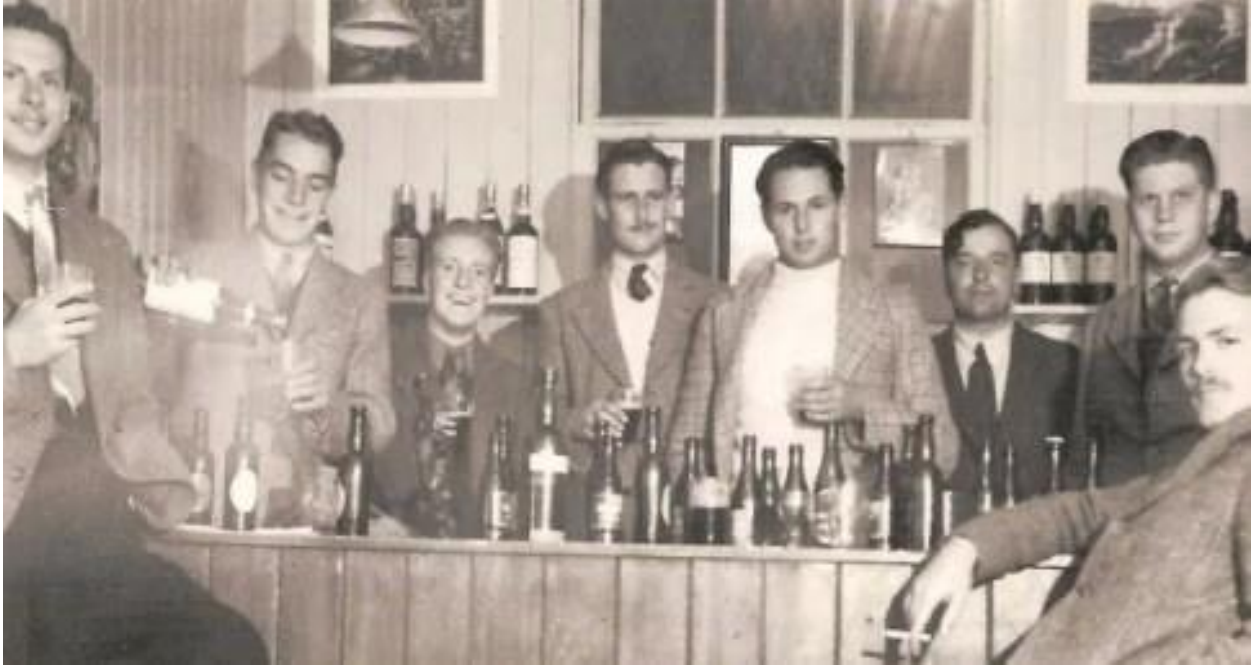
German Prisoners Drinking at Local Irish Pub

During World War II, a Canadian bomber flying from a base in Scotland crashed in what the crew thought was the vicinity of their airfield. Spotting a pub, they entered to celebrate their survival with a quick drink but were stunned to see a group of soldiers wearing Nazi uniforms and singing in German. Even more confusingly, the Germans responded to their entry by shouting at them to "go to their own bar." The crew was soon given an explanation: after getting lost they had crashed in the Republic of Ireland . . . and now they were captured, just like the Jerries.