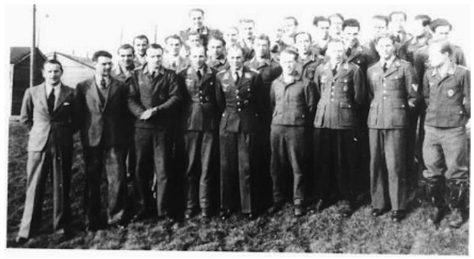
British prisoners at the camp

In 1943 it became clear that the Allies were slowly winning, British airmen were moved to a separate camp and secretly freed, while 20 Germans were allowed to rent residences in Dublin and attend the local colleges. All remaining German prisoners were repatriated after the war, ending the history of what might well have been history's strangest, and possibly most comfortable, POW camp.