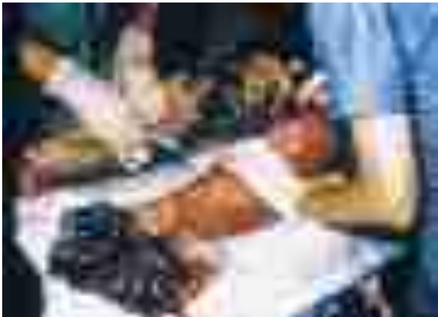
A photograph taken in the Field Hospital of a soldier wounded by a M16 mine

Australian public, just as the true, total number of casualties was. Casualties invariably arrived on Air Force bases away from prying eyes, and quickly despatched to hospitals without journalists knowing they had arrived.