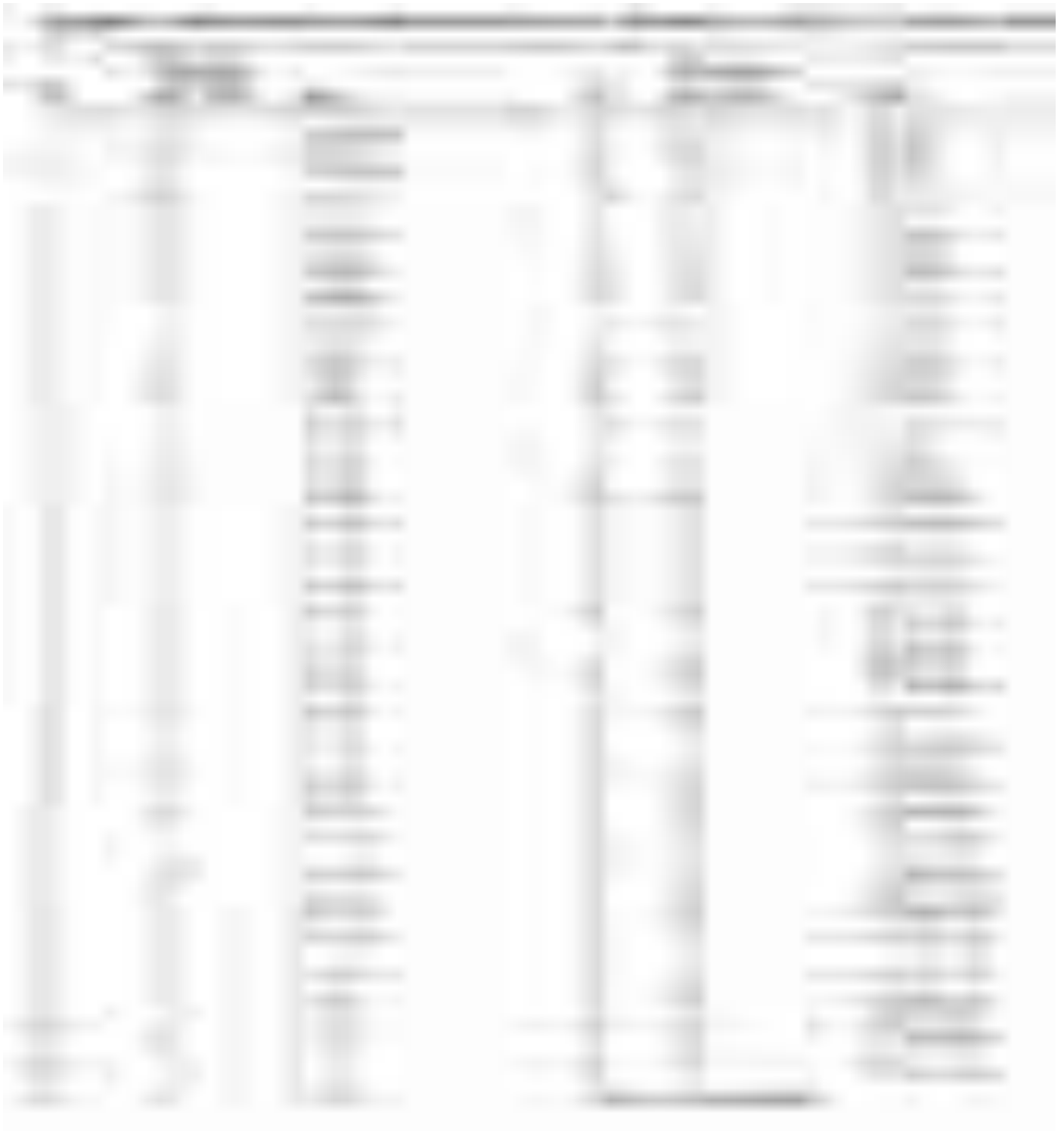
Mine casualties, 1969

In total, 95 Australian soldiers were killed by mine explosions, and 600 men wounded.