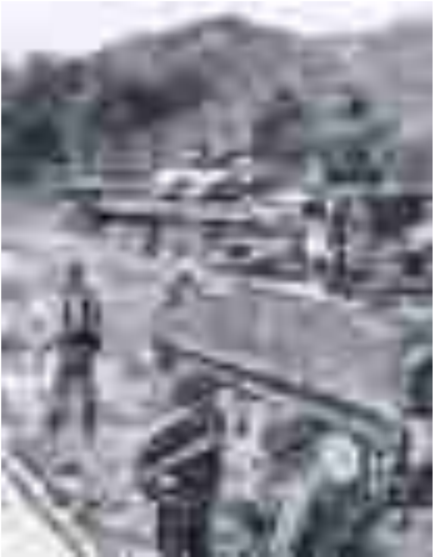
Australian tanks and APCs on Operation