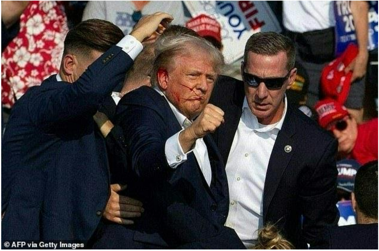
The FBI is investigating the shooting by Crooks at a Trump rally as an act of domestic terrorism