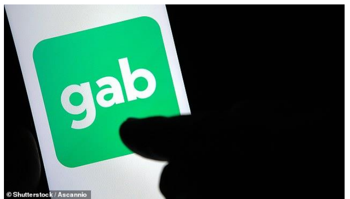
The Anti-Defamation League has said Gab is a 'haven for hate and disinformation

The FBI is investigating the shooting by Crooks at a Trump rally as an act of domestic terrorism.