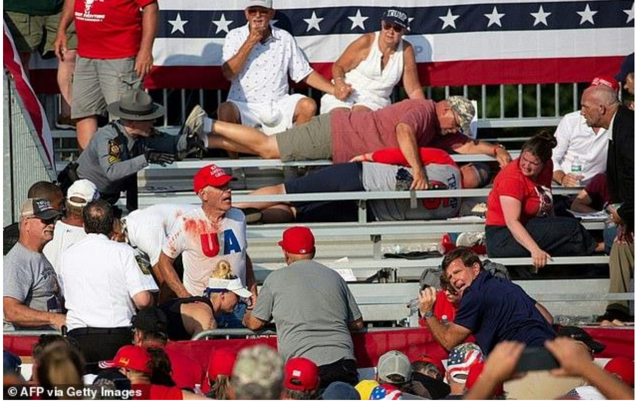
Members of the crowd in Butler, Pennsylvania rushed to his aid following the shooting