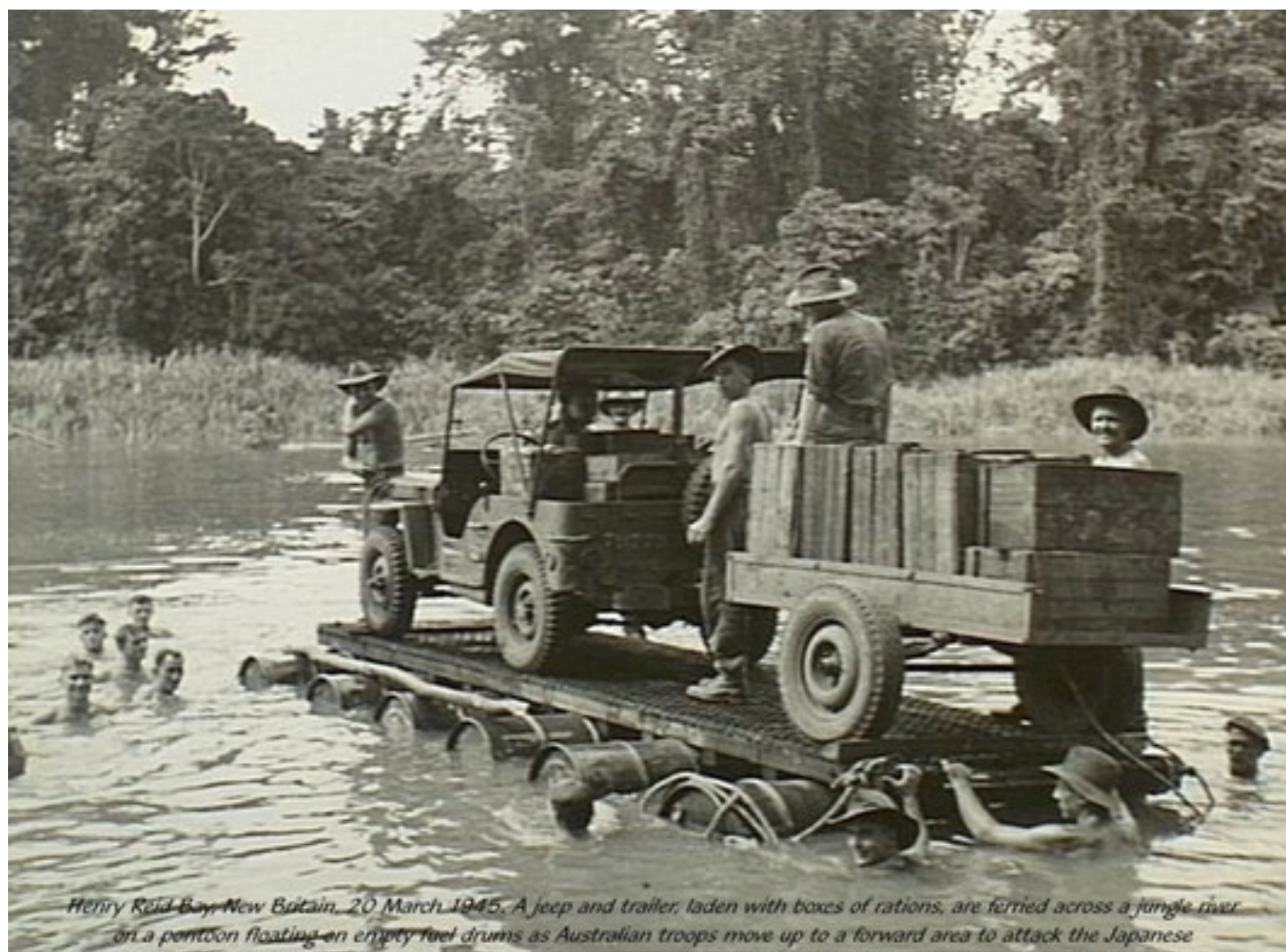
Henry Reid Bay, New Britain, 20 March 1945. A jeep and trailer, laden with boxes of rations, are ferried across a jungle river on a pontoon floating on empty fuel drums as Australian troops move up to a forward area to attack the Japanese