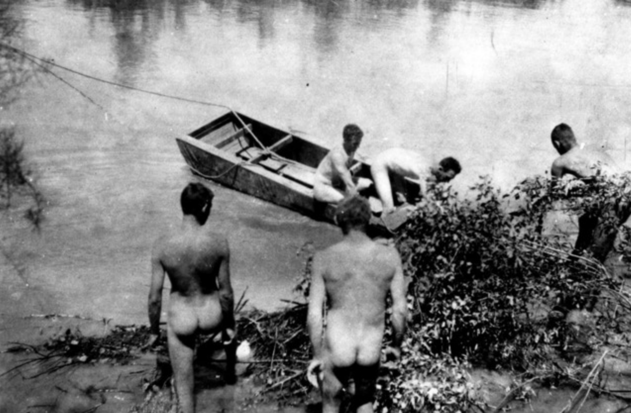
Naked unidentified soldier salving limbers from the Jordan River at Ghoraniyeh. The limbers were washed into the river after heavy rain. 1917