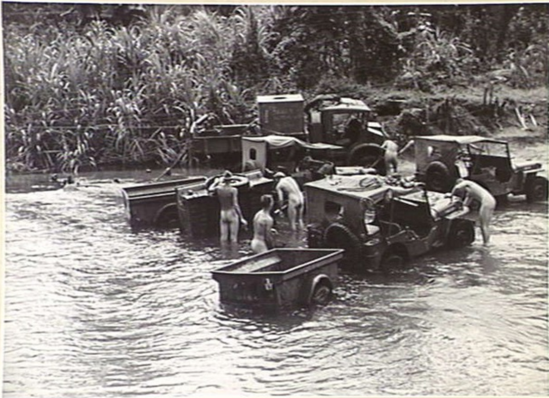
BOUGAINVILLE, 1945-07-31. TROOPS OF 29 INFANTRY BRIGADE WASHING THE HEAVY MUD OF THE BUIN ROAD OFF THEIR VEHICLES IN THE OGORATA RIVER AND FINDING NO SHORTAGE OF WATER.