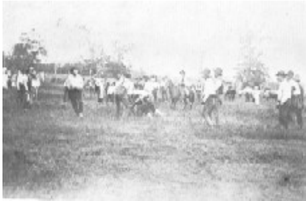
Indian boys playing near Spencer Academy, Doaksville