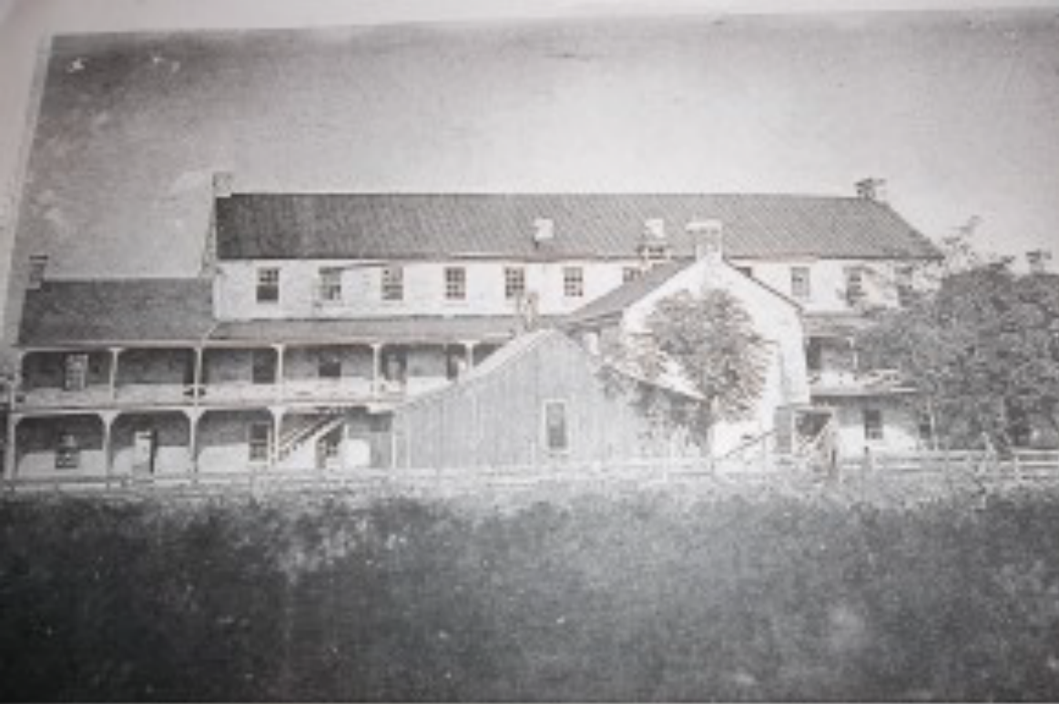
Photograph of Wapanucka Academy, Chickasaw Schools File, Holisso Research Center, Chickasaw Cultural Center, Sulphur, Oklahoma