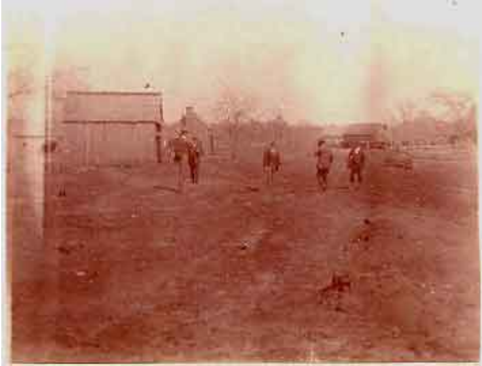
Early photo of Doakville, probably dating to the mid-19th century

Doakville is the oldest community in the Choctaw Nation