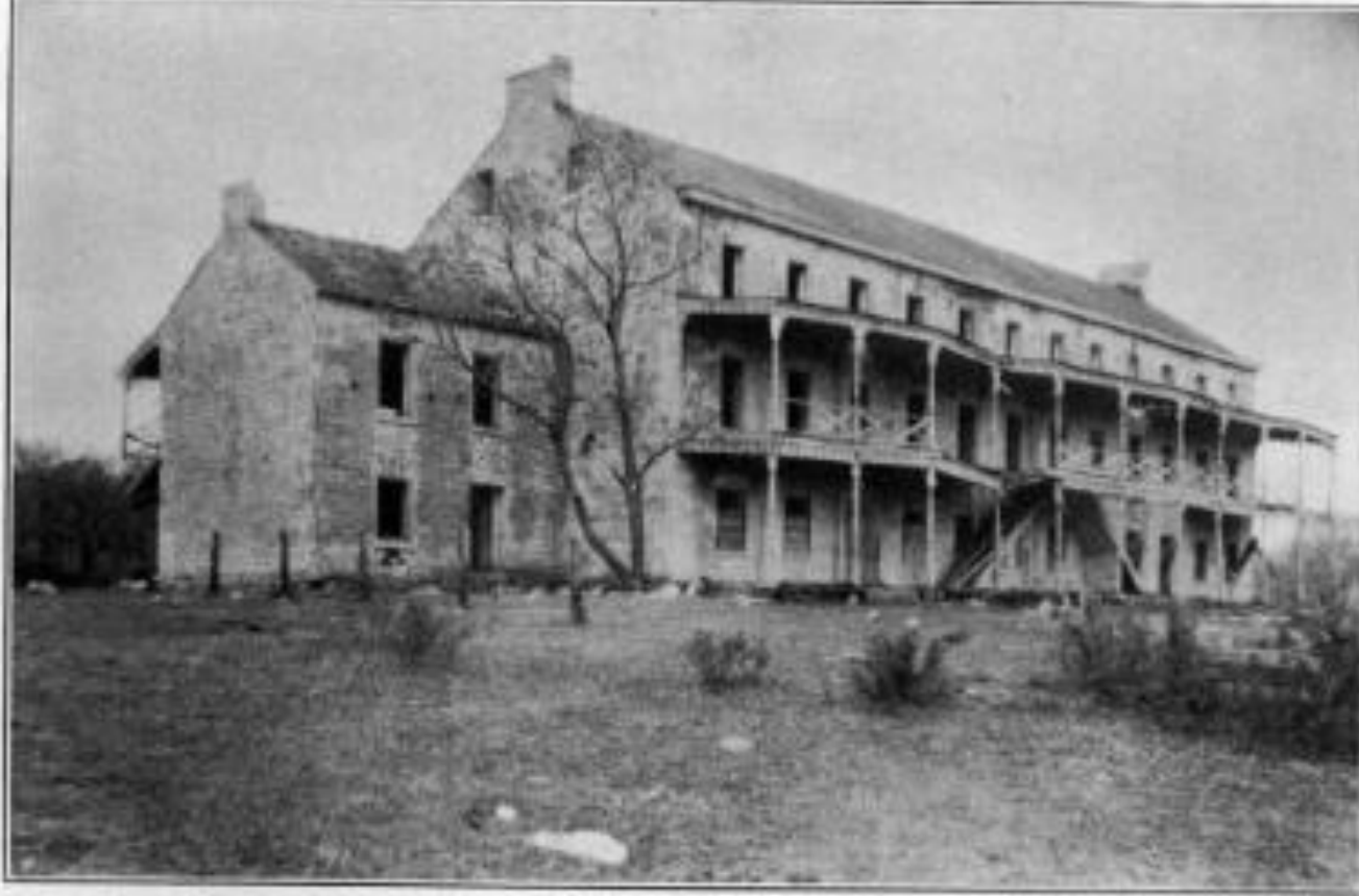
WAPANUCKA INSTITUTE TODAY