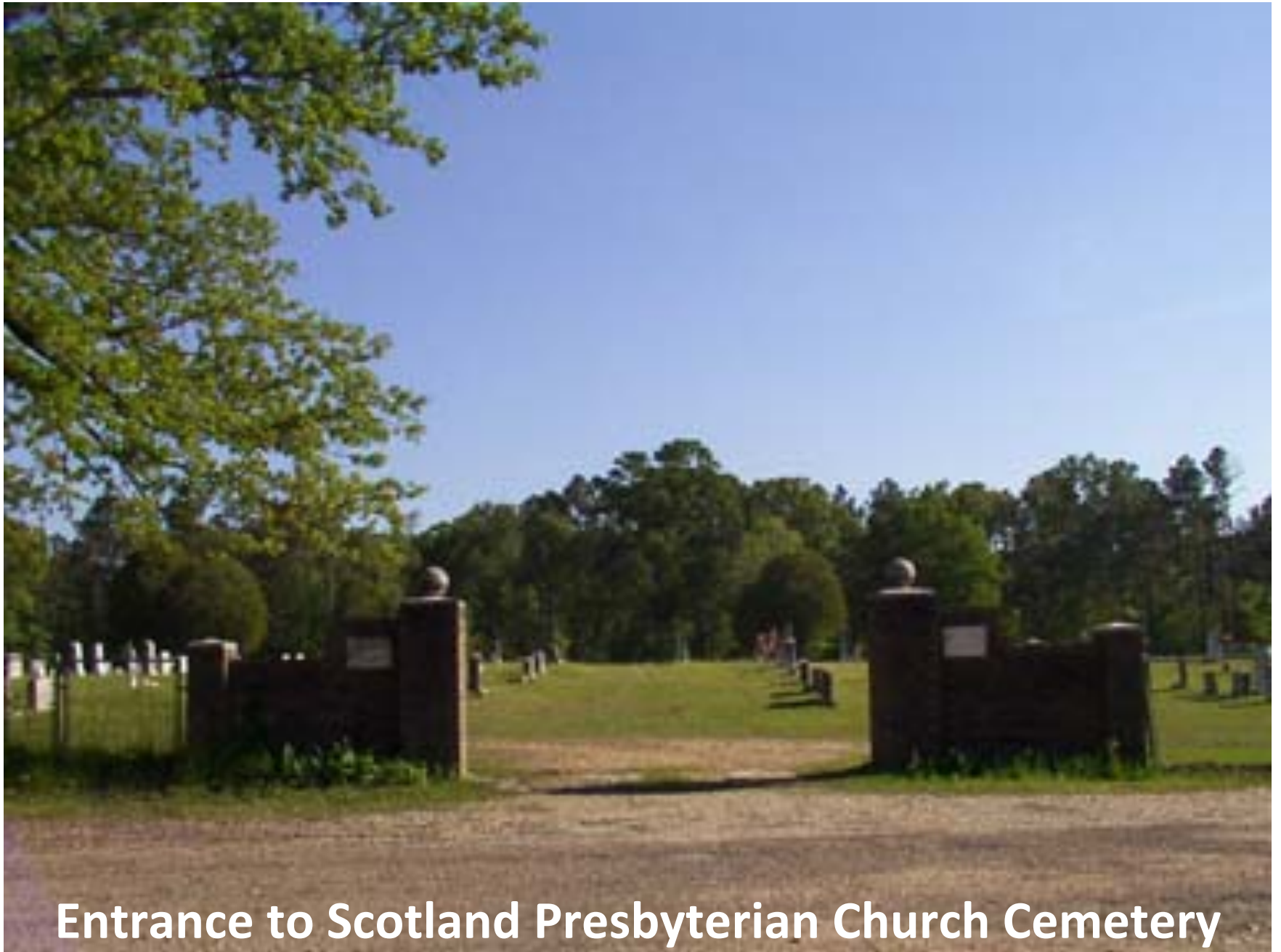
Entrance to Scotland Presbyterian Church Cemetery