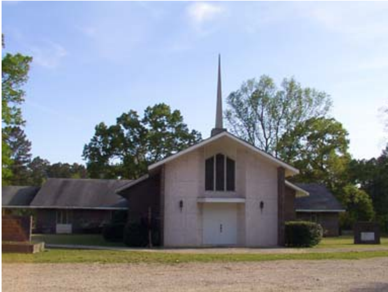
Scotland Presbyterian Church (as it looks today), formerly the McCorvey Mission 1841- 1845