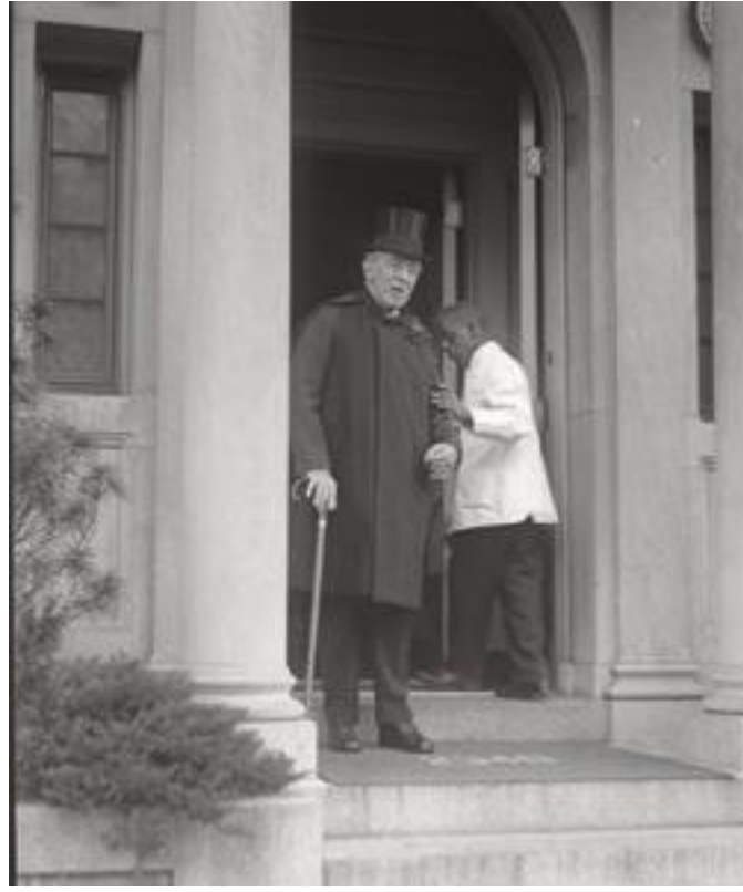
Private Citizen: Retiring in 1921, Wilson