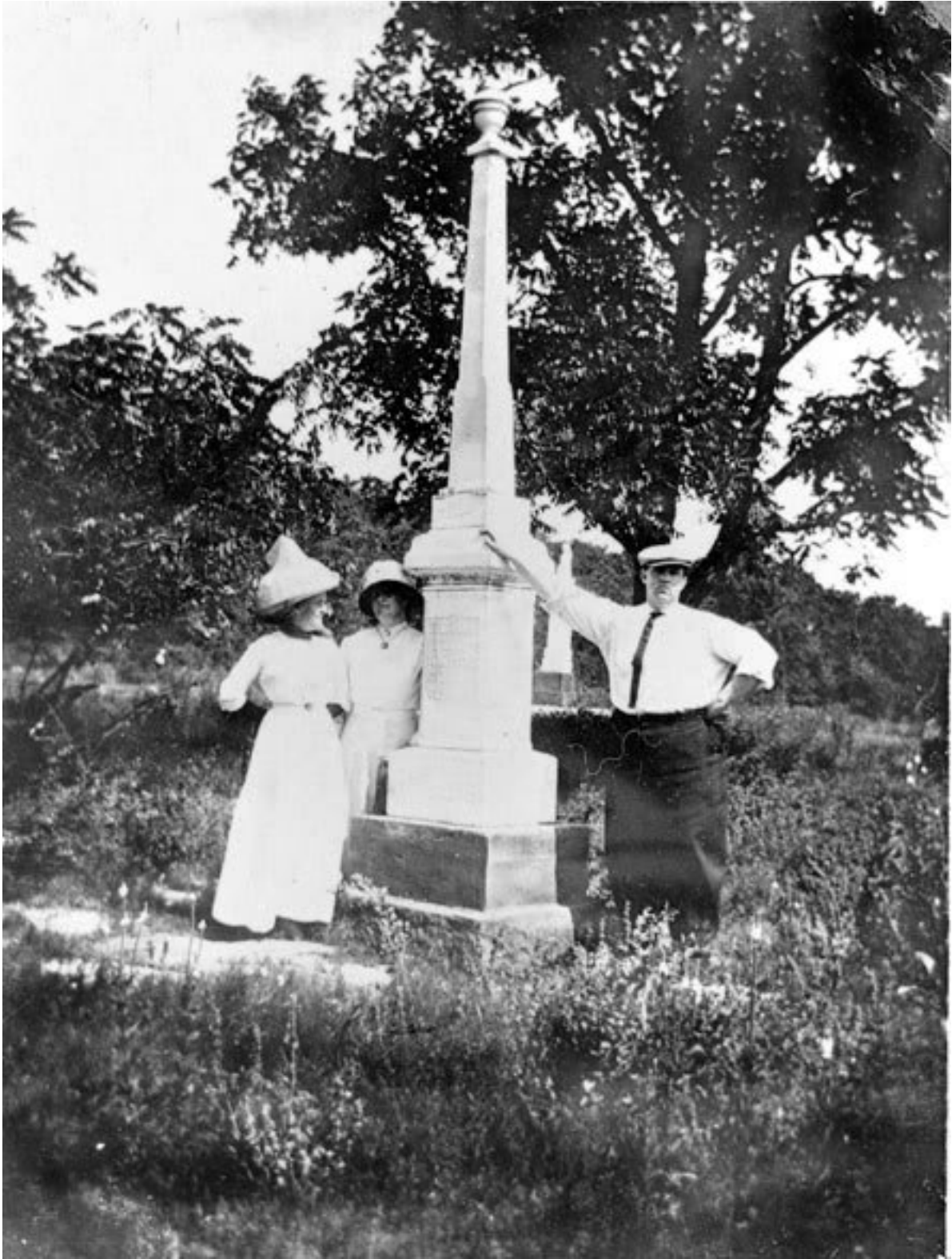
The Confederate monument at Pea Ridge is shown above. Long before the Pea Ridge battlefield was declared a national monument, many