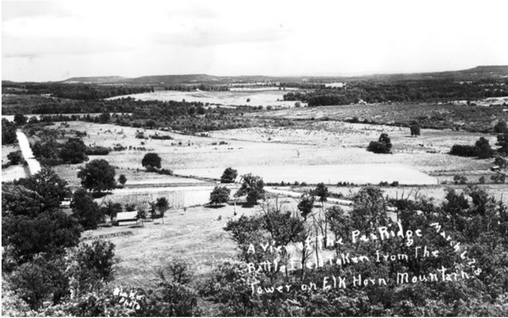
The Pea Ridge National Military Park is shown above.