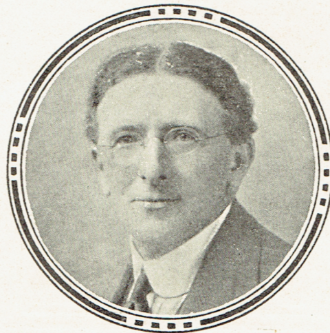
ALBERT W. KETELBEY

In the world of composition, it is true to say that many are called but few are chosen. A thorough knowledge of musical theory is, of course, a sine qua non ; in addition, there are four indispensable requirements of successful light music: Sincerity, emotional impulse, vigour of rhythm, and good craftsmanship.