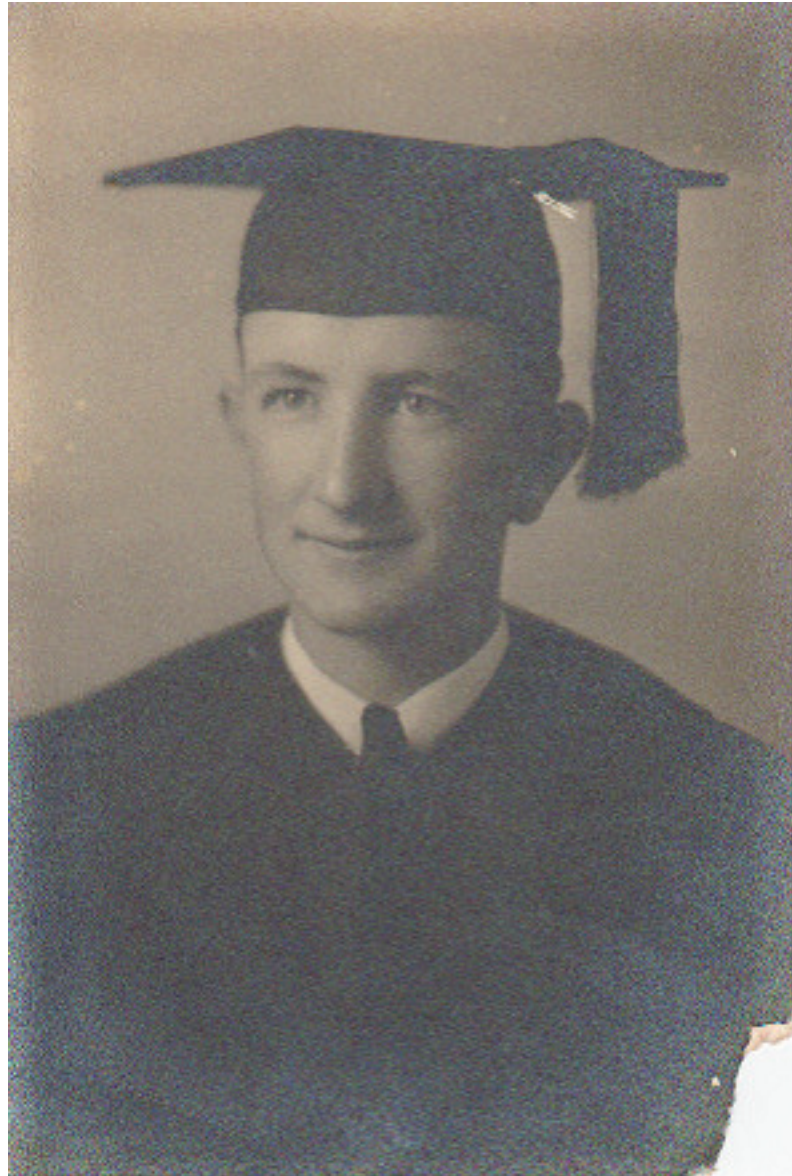
High School Graduation