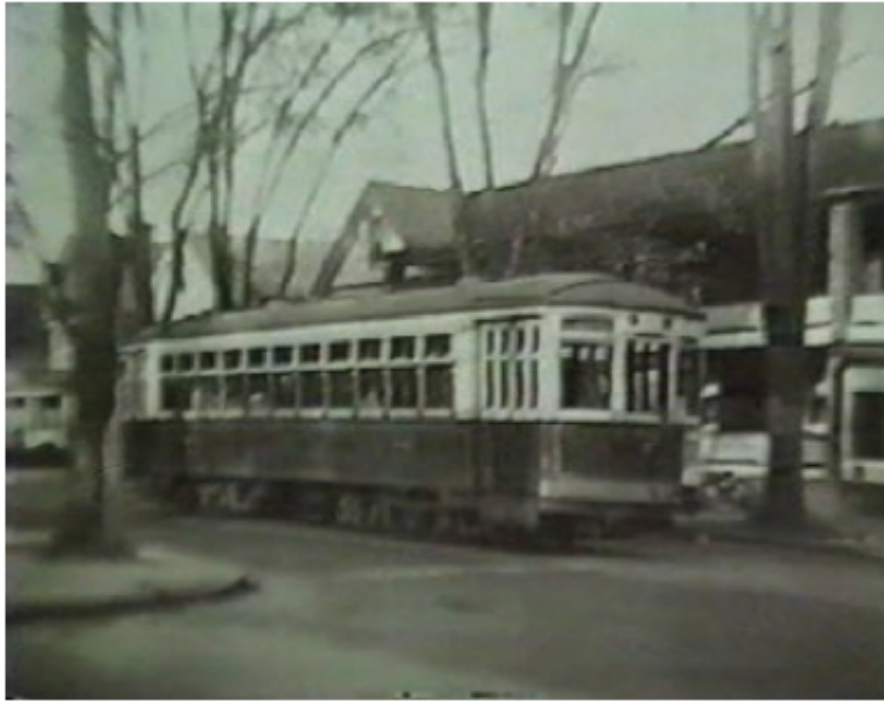
Street Car (Trolley) on 1100 block of Chesapeake Avenue, getting ready to cross over Ohio Street. Photo is taken from corner where Chesapeake Avenue Methodist Church is located.