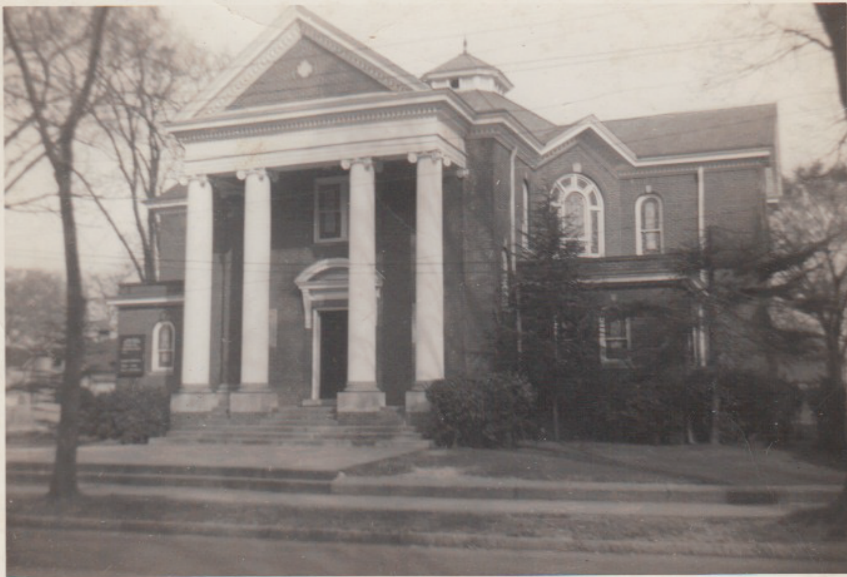
Early picture of South Norfolk Baptist before the Educational Building was erected.