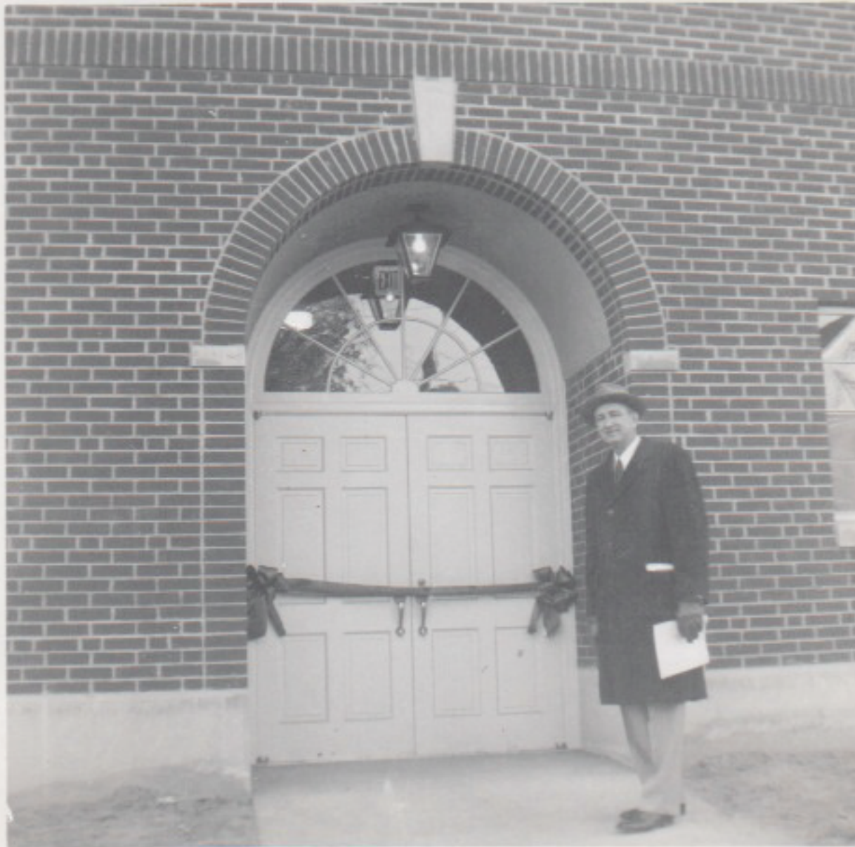
Dedication day of the new Education Building, SNBC