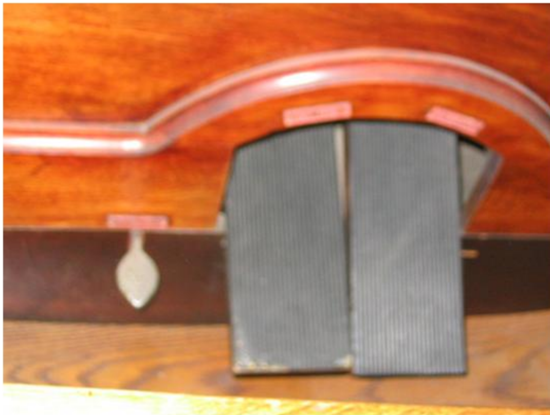
Toe stud, Swell, and Crescendo Pedals.