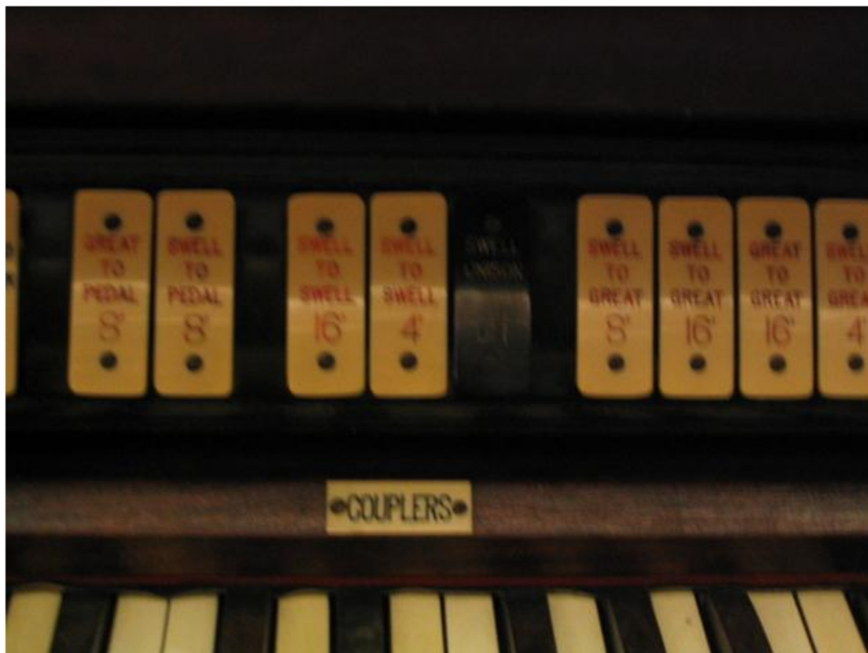
Couplers, including “Swell Unison Off” black tab.