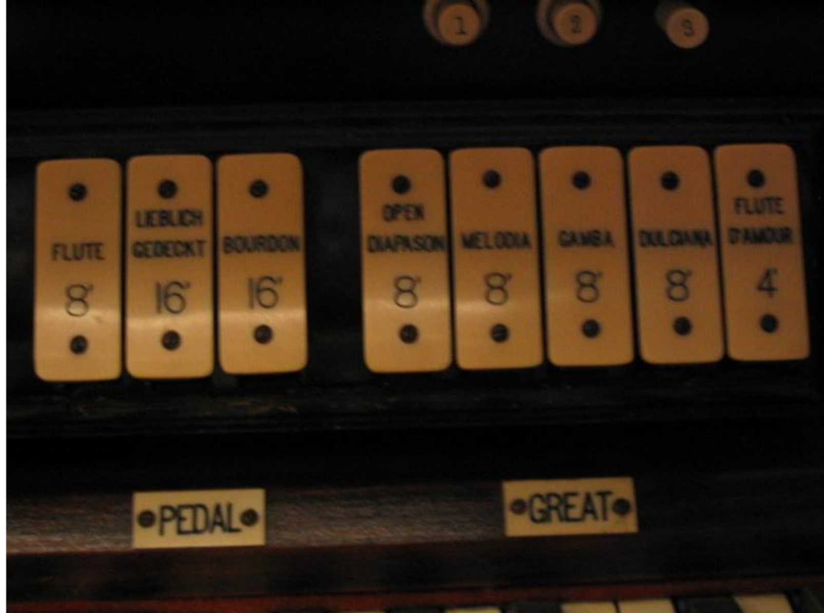
Pedal, Great division; note three of the six Combination Setters above.