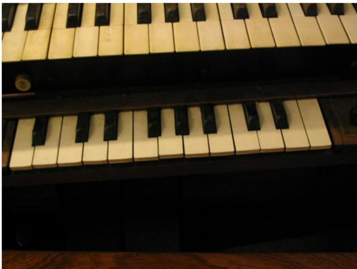
Close-up of Deagan chime keyboard.