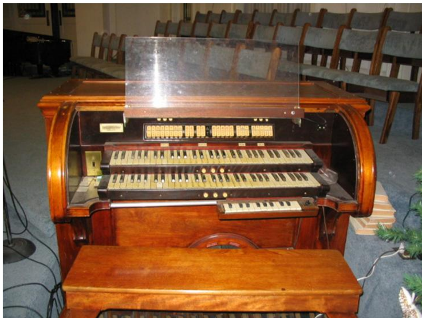
Console with new lighted music rack added in renovation. Deagan chime keyboard below Great manual.