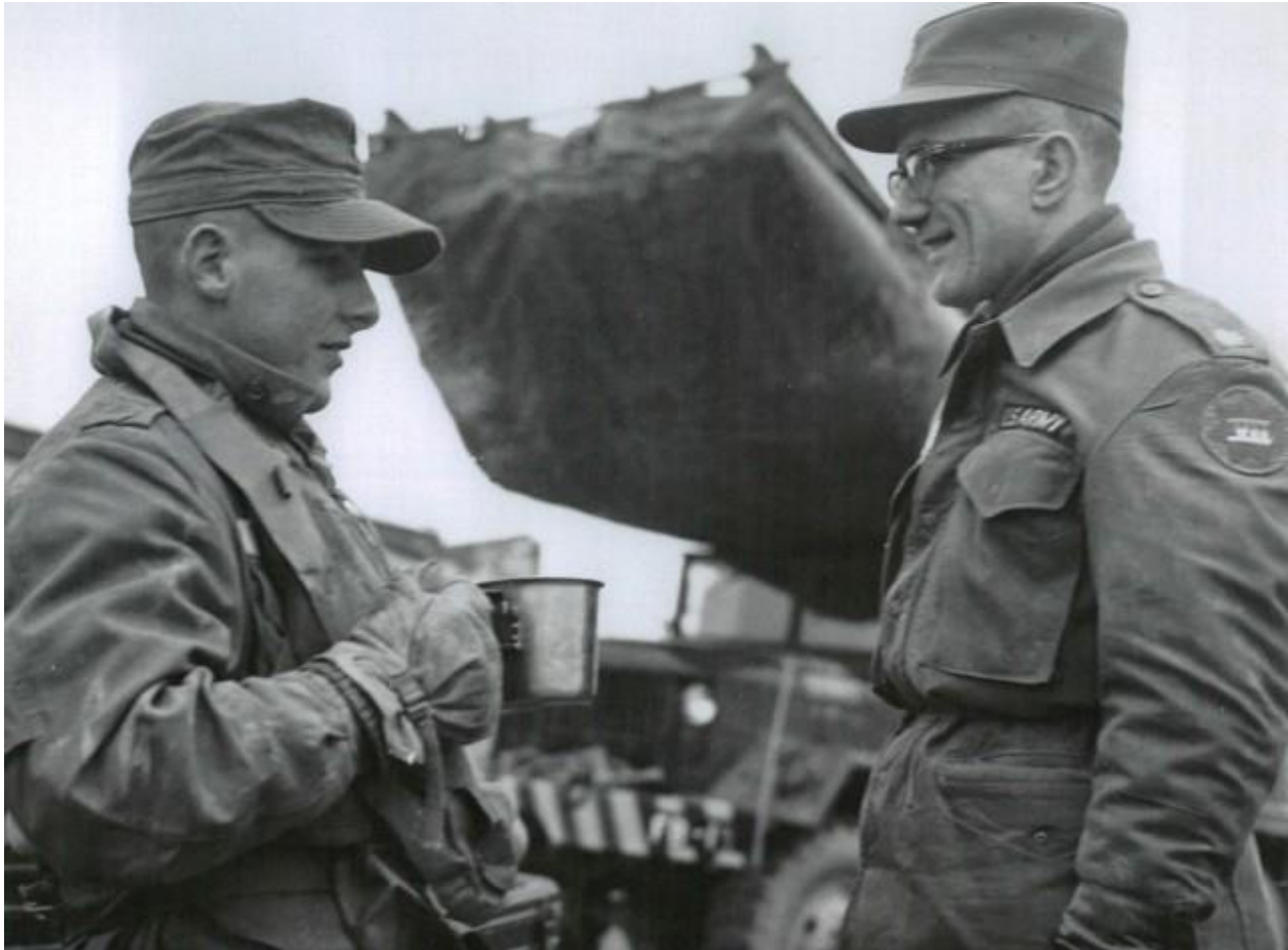
2 / 2 Show Caption + VIEW ORIGINAL

With the regulatory support that had developed, the Army Chaplain School developed training materials for “The Chaplain as Personal Counselor” in 1948, highlighting the importance of safeguarding all Soldiers’ confidential communication with chaplains.(6) Chaplain Corps training on confidentiality has continued ever since, and the Corps continues to evaluate how best to support privileged communication. As a part of its 2023 Capabilities-Based Assessment approved by the Army Futures Command Futures and Concepts Center to help design the future Army of 2040, the Chaplain Corps identified the requirement to provide absolute confidentiality in cyberspace as an essential component of attending to the human dimension within the context of multidomain operations.