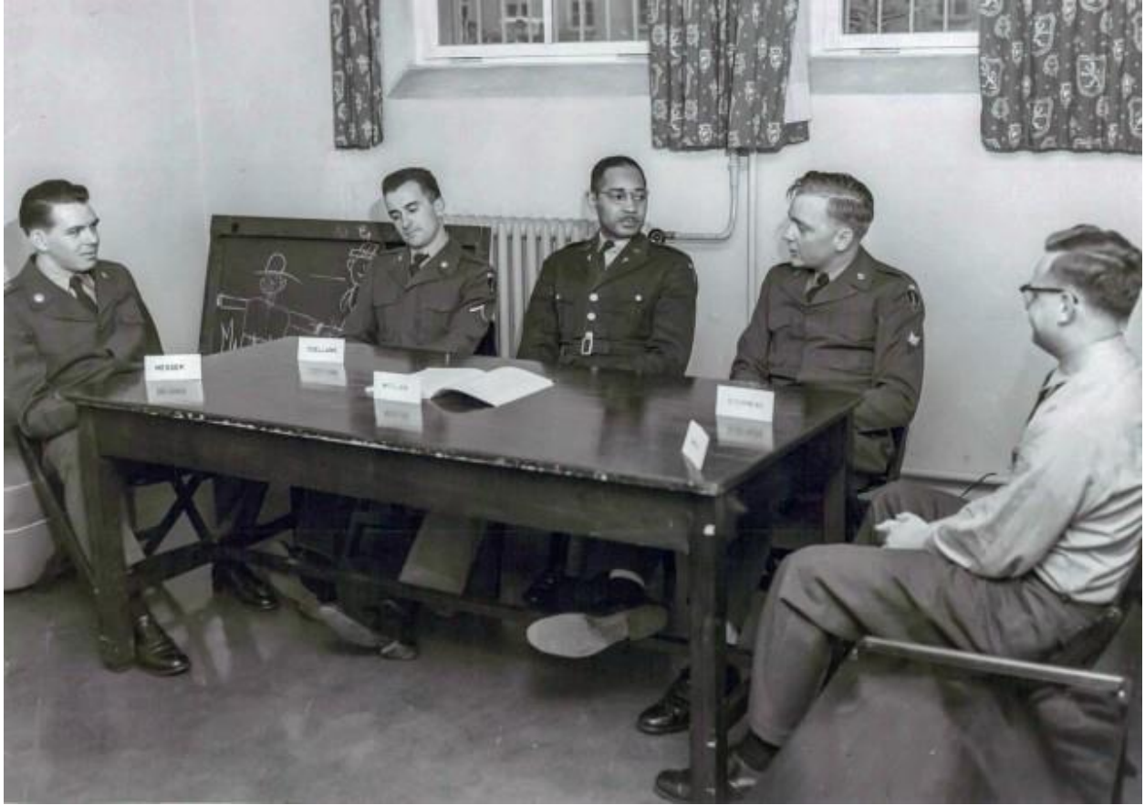
1 / 2 Show Caption + VIEW ORIGINAL