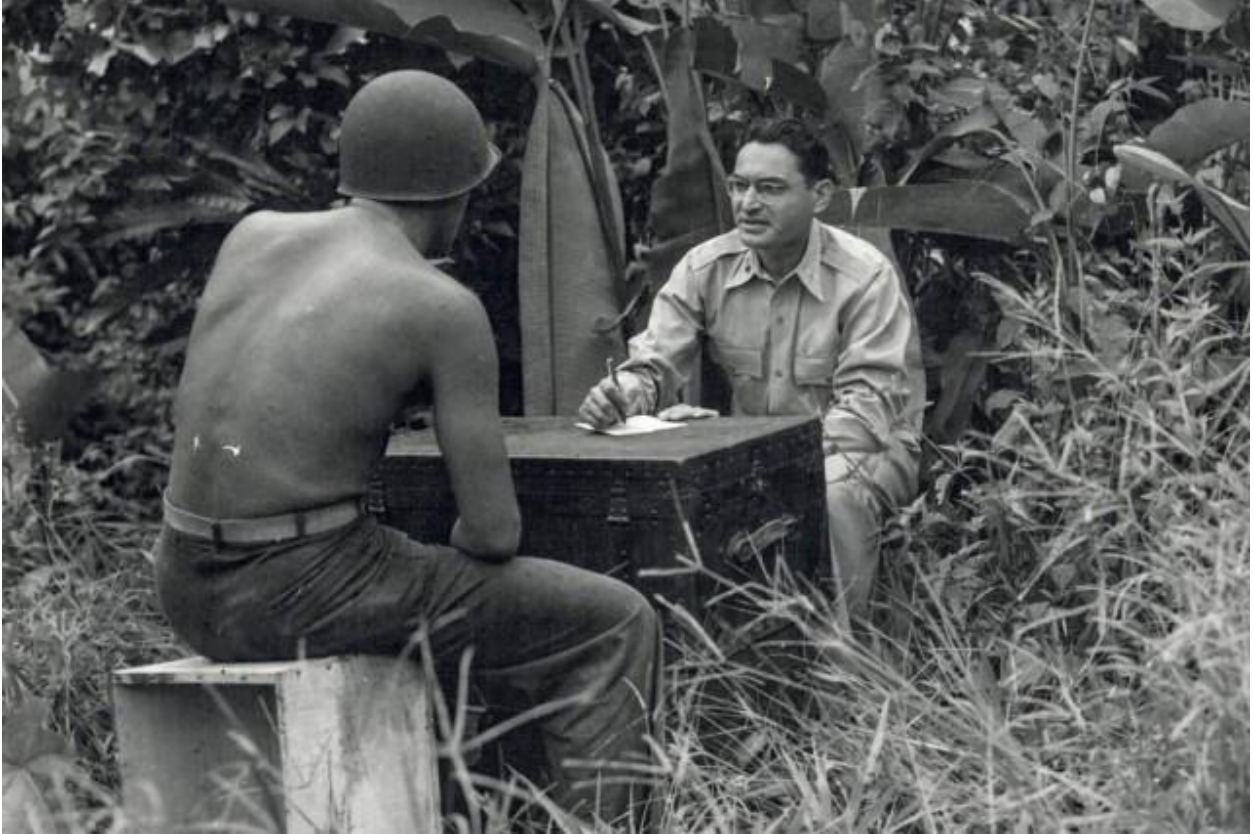
2 / 3 Show Caption + VIEW ORIGINAL