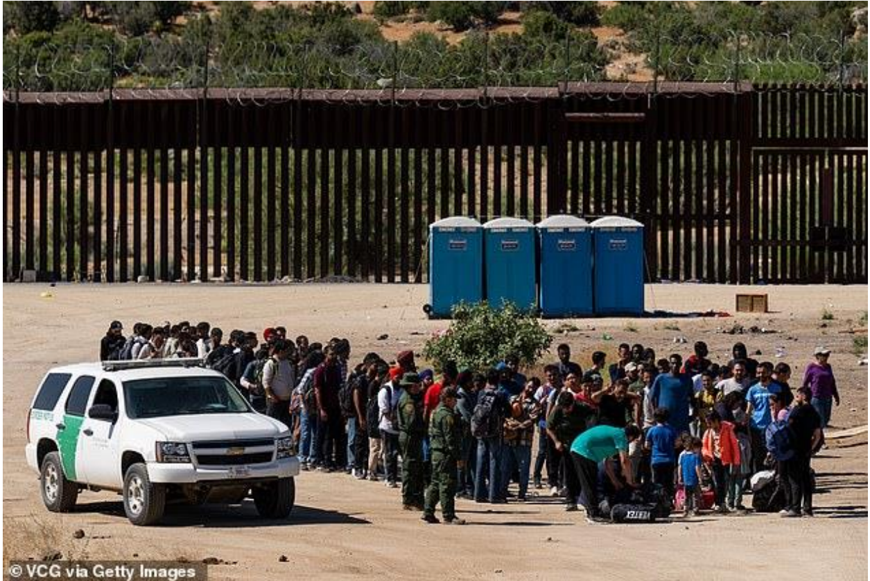
Migrants wait to be processed by U.S. Border Patrol agents after crossing into the U.S. from Mexico on June 14, 2024 in Jacumba Hot Springs, California. FEMA has received over $1 billion to shelter non-citizens since 2023