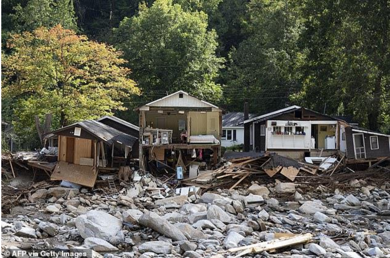
Destroyed houses in the mountains of North Carolina

FEMA did not immediately respond to a request for comment.