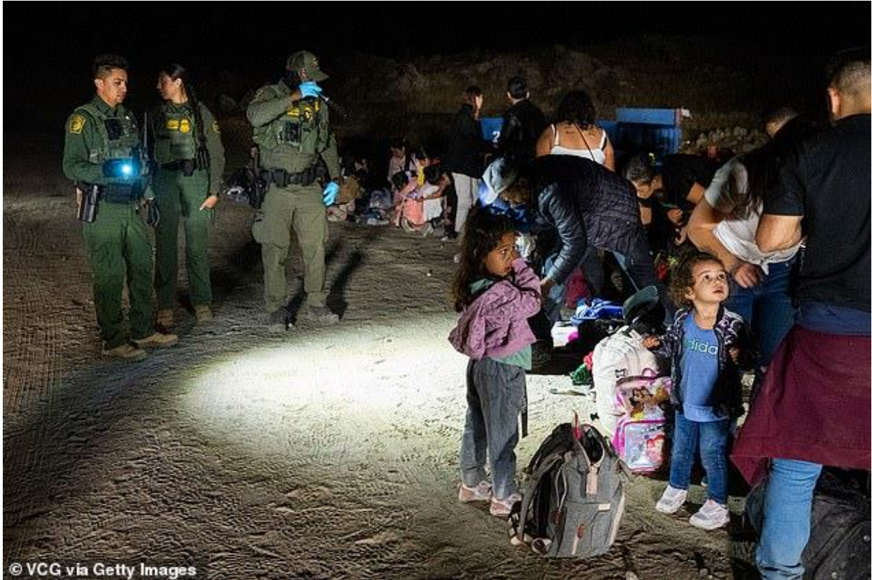
Migrants are processed by U.S. Border Patrol agents after crossing into U.S. from Mexico through an abandoned railroad

'We are meeting the immediate needs with the money that we have,' Mayorkas said Wednesday. 'We are expecting another hurricane hitting.'