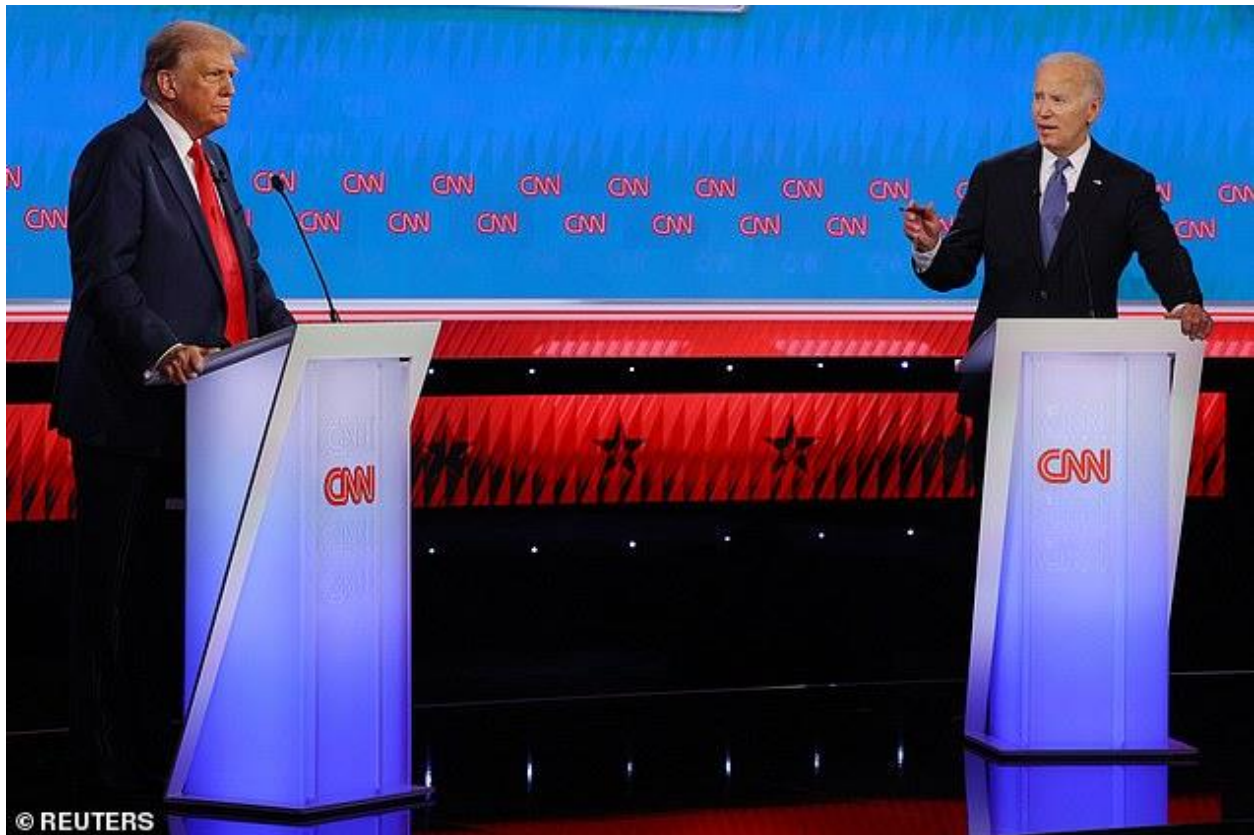
Donald Trump and Joe Biden at the first presidential debate

The two men did not shake hands after they entered the stage, Biden arriving first and then Trump. They simply stood at their podiums, starting straight ahead.