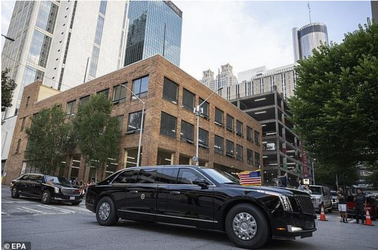
A presidential motorcade in Atlanta