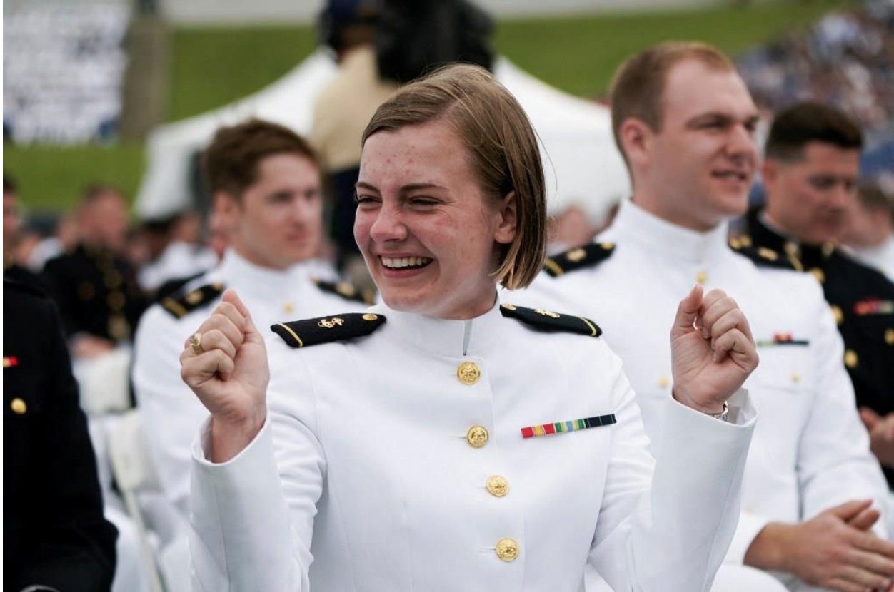
A midshipman celebrates their graduation and commissioning.

Bellino and Staubach are the only two Navy football players to win the Heisman Trophy as the best college football players in America. Bellino won the award in 1960, while Staubach did so in 1963.