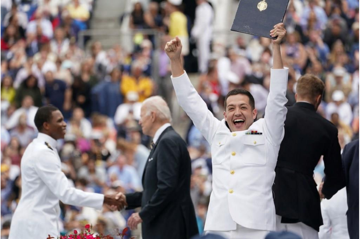
A newly commissioned Navy officer celebrates.

About two weeks later, Biden told an Idaho audience that his “first job offer” came from local lumber and wood products business Boise Cascade. The company said it was news to them and Biden had not previously described an interest in moving to the state.