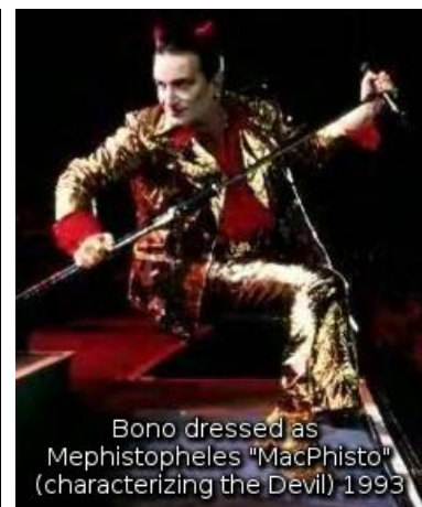
Bono dressed as Mephistopheles "MacPhisto" (characterizing the Devil) 1993

-Paul "Bono" Hewson, Mother Jones Magazine , Vol. 14, No. 4, p. 35, ISSN: 0362-8841