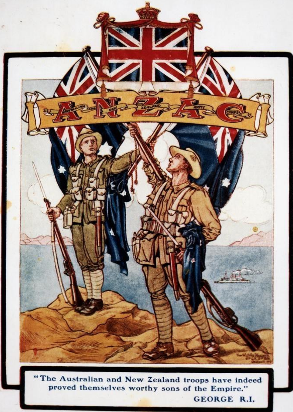
"The Australian and New Zealand troops have indeed proved themselves worthy sons of the Empire." GEORGE R.I.