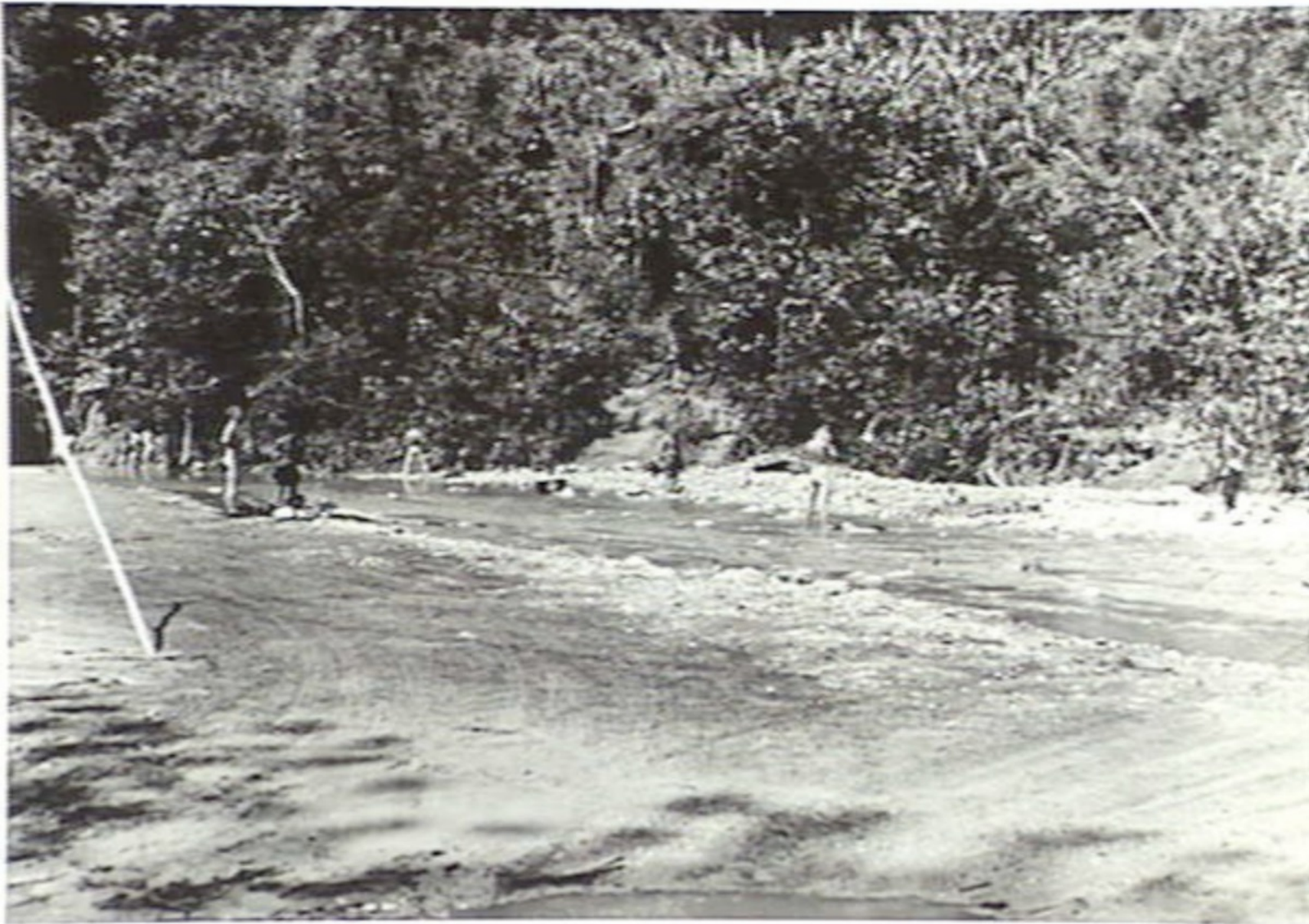
SOWI RIVER, NEW GUINEA. 1943- 12-29. AUSTRALIAN TROOPS REMOVING THE SWEAT AND GRIME OF THE JUNGLE MARCH IN A SHALLOW MOUNTAIN STREAM.