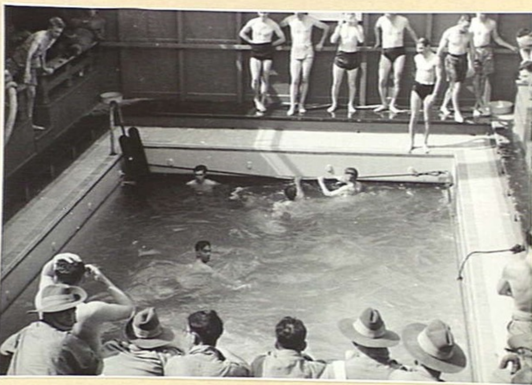
PORT TEWFIK, EGYPT. 1942-02. TROOPS OF THE A.I.F. RETURNING TO AUSTRALIA FROM THE MIDDLE EAST ENJOYING THEMSELVES IN THE SWIMMING POOL ON BOARD THE TROOPSHIP, A CONVERTED PASSENGER LINER.