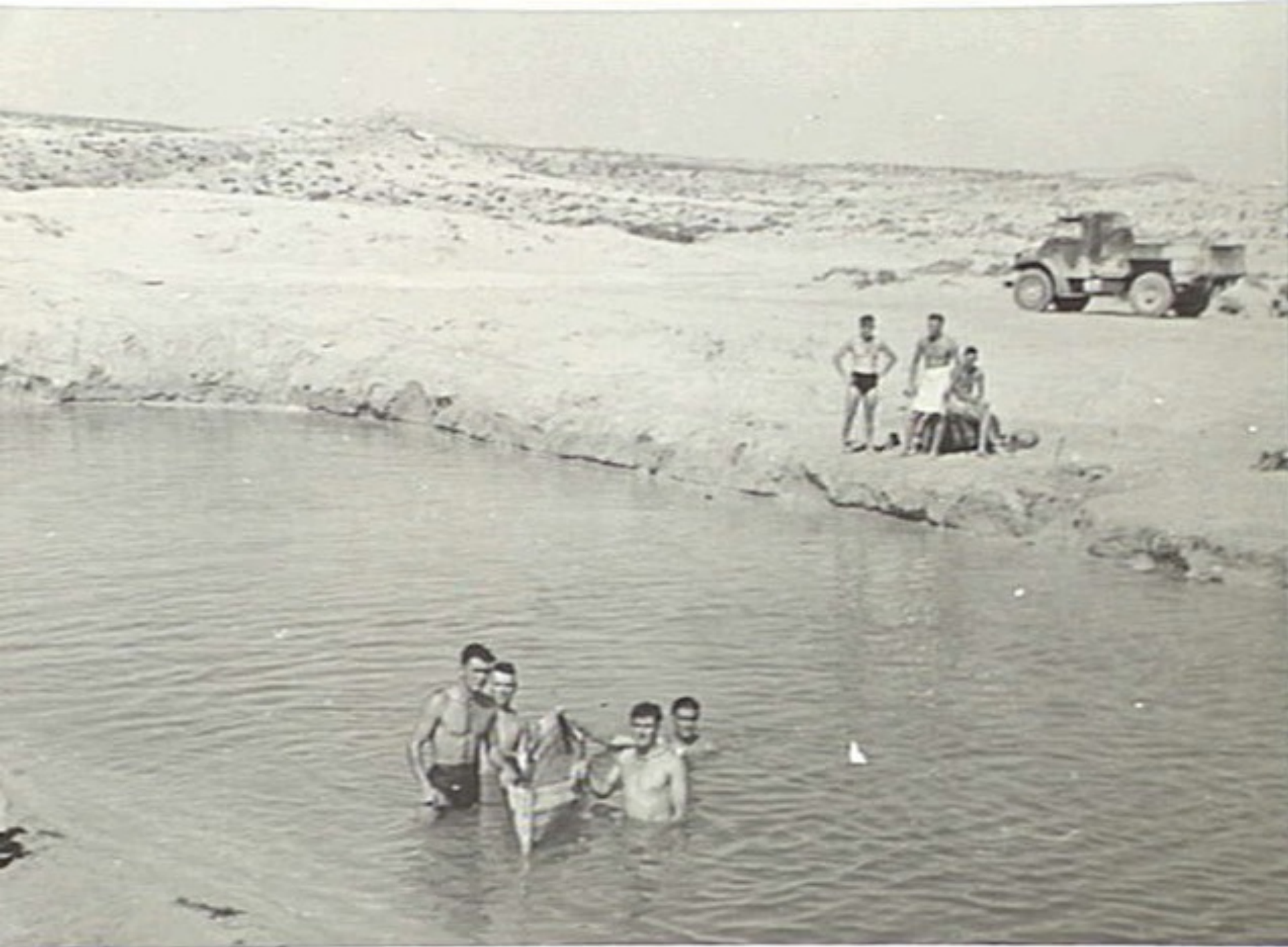
WESTERN DESERT, EGYPT. 1942-07- 28. AUSTRALIAN SOLDIERS SWIMMING IN THEIR HOME- MADE BATHE AT A LAGOON NEAR EL ALAMEIN. NOTE THE TIN CANOE IN FOREGROUND.