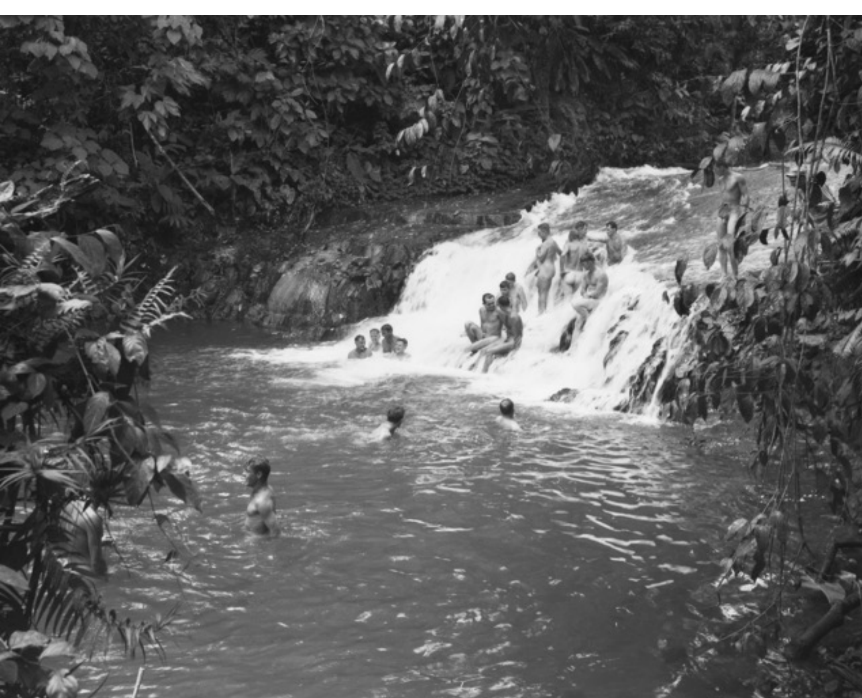
THE SOLOMON ISLANDS, 1945-02-26. AUSTRALIAN AND NEW ZEALAND SERVICEMEN TAKING IT EASY IN RIVER RAPIDS AND POOL.