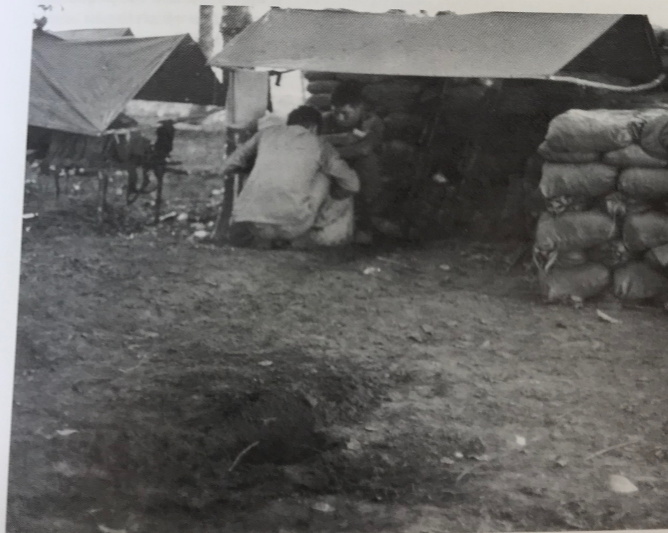
Mortar crater outside Cpl Vic Zhukov's bunker.

Before launching the Battalion's next major operation, Napier, the companies were deployed in the usual lower level operations in areas of concern to the Task Force. A Coy, temporarily commanded by Capt Fairhead, had taken over responsibility for the Horseshoe on 28 December 1969, and its first operational tasks were to continue protecting the land clearing team and patrol into the Long Green. During its stay at the Horseshoe, A Coy suffered some casualties when 13 mortar bombs were fired at the position from within Dat Do. At the same time as the mortaring, an enemy force attacked an ARVN post within Dat Do, suffering a number of casualties in doing so. The mortaring may have been a diversion to deter A Coy from reacting to the attack on the ARVN post. Two A Coy soldiers, Lcpl JW McLennan and Pte J Johnson, were lightly wounded by mortar fragments. One former member attached to A Coy recalled the mortaring: Soldiers occupying the Horseshoe slept in four-man tents but if the position came under any form of attack, they were supposed to occupy their weapon pits. On this occasion, Cpl Vic Zhukov heard the rounds landing but remained in his tent as his sand-bagged tent was too far from his bunker. His decision to remain paid off. The next morning, he found that one of the rounds had exploded at the entrance to his bunker. Pyrotechnic ammunition held inside the bunker was still spitting and fizzing. Anyone inside would have been injured or more likely killed.