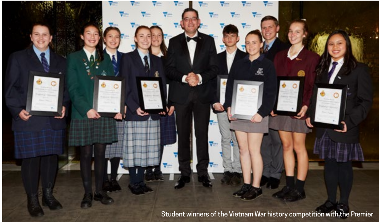
Student winners of the Vietnam War history competition with the Premier