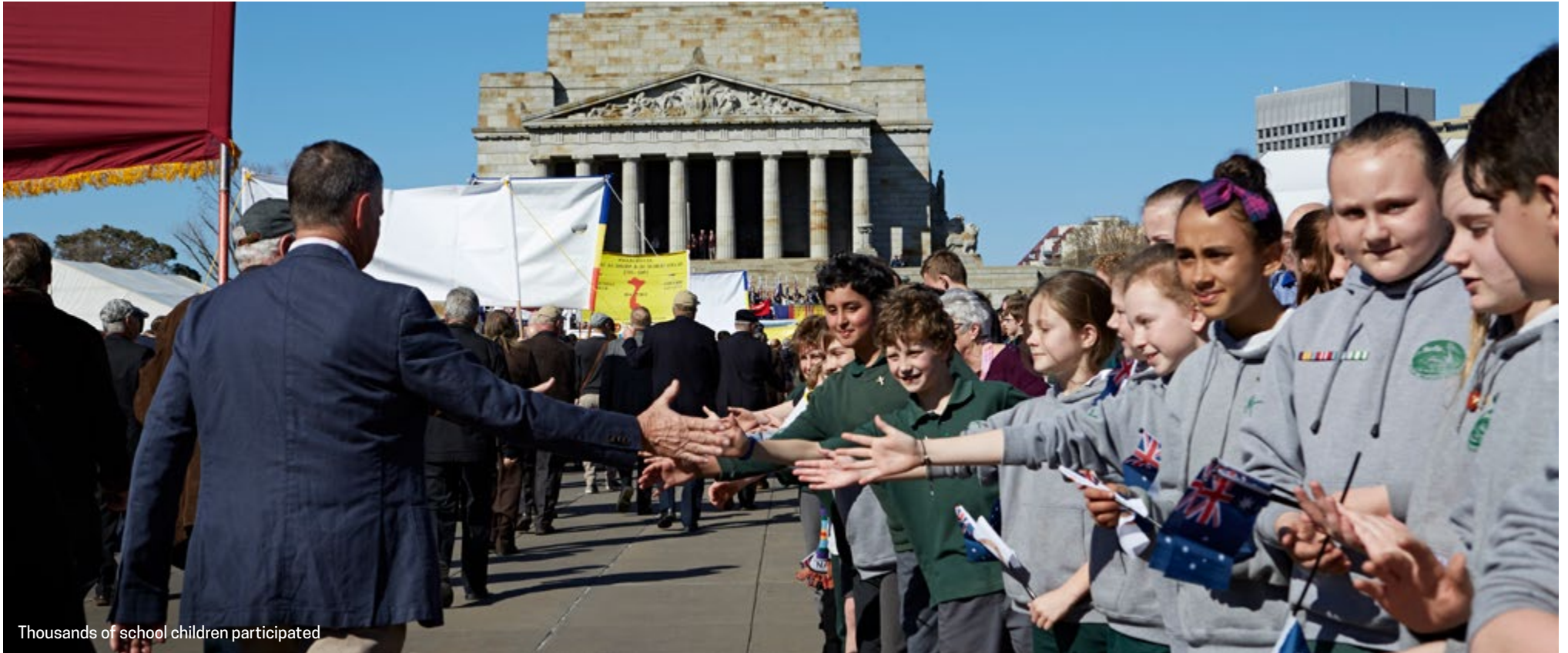
Thousands of school children participated