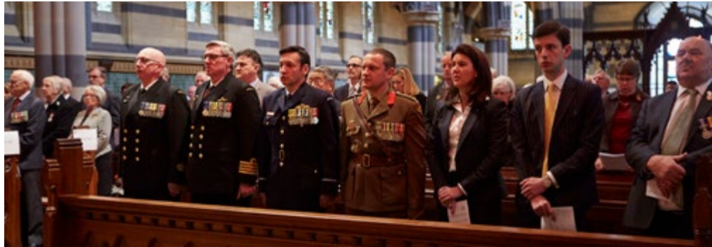
A non-denominational service of thanksgiving for service and sacrifice.