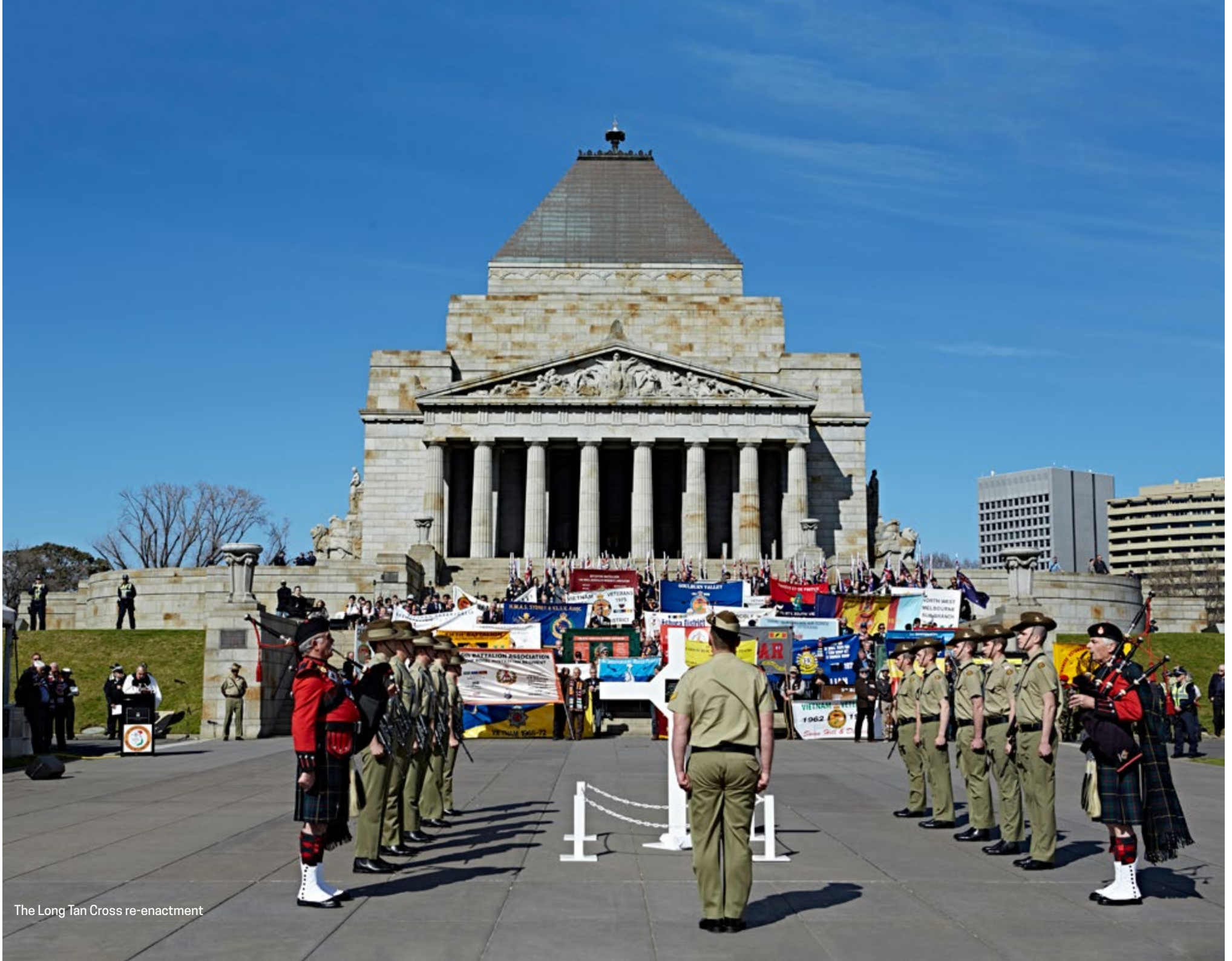
The Long Tan Cross re-enactment