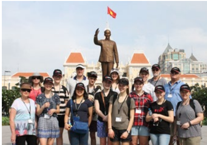
“I stood at the battle of Long Tan site in shivers”