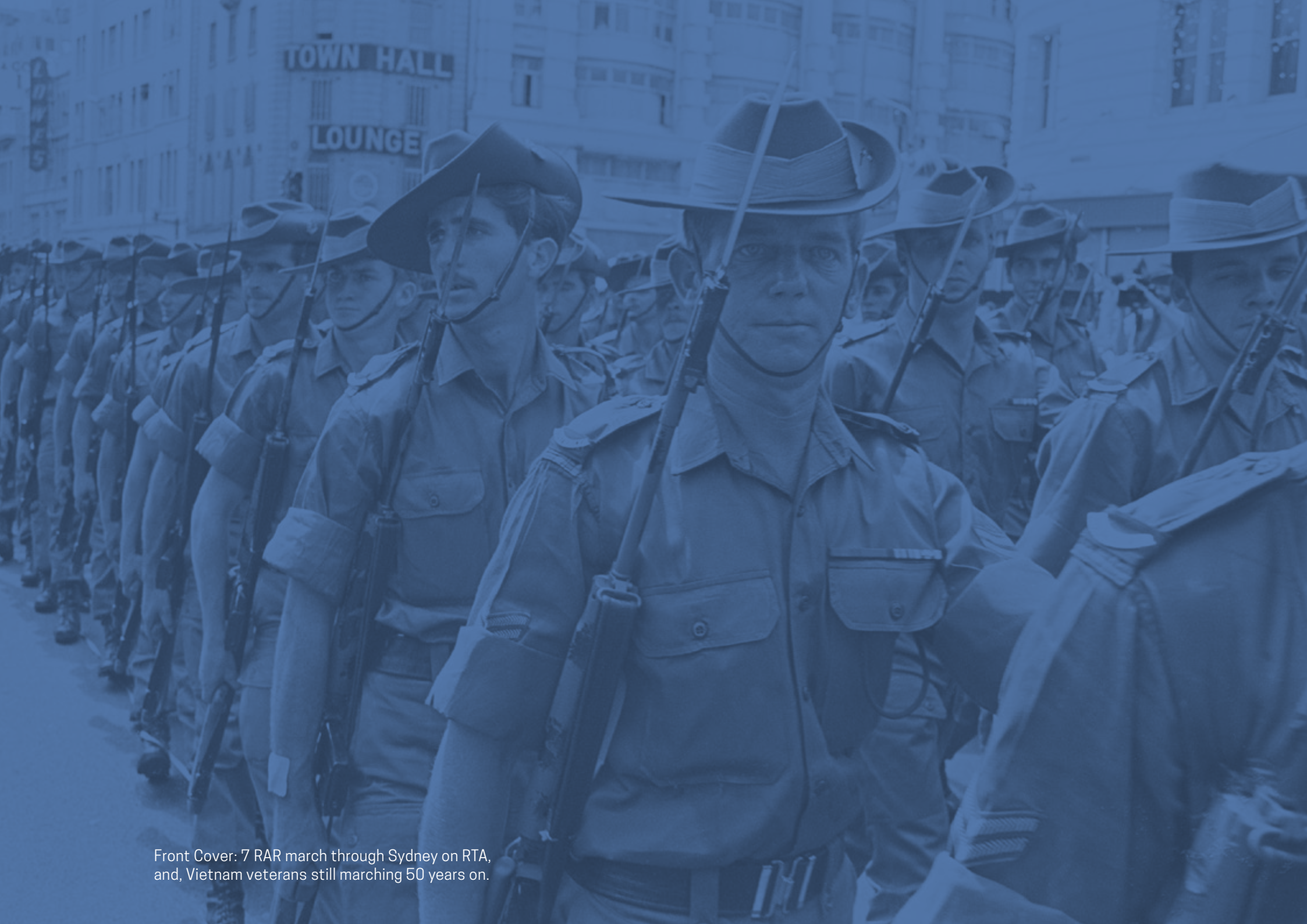
Front Cover: 7 RAR march through Sydney on RTA, and, Vietnam veterans still marching 50 years on.