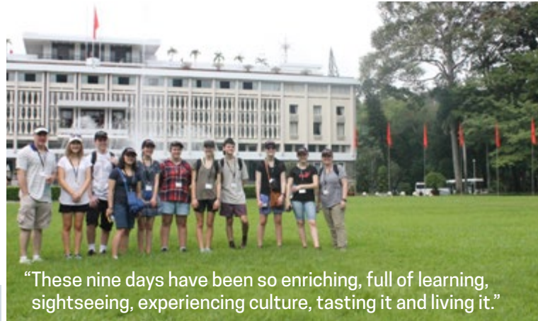
“These nine days have been so enriching, full of learning, sightseeing, experiencing culture, tasting it and living it.”