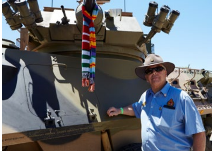
Left: Proud connections with the winner of the Long Tan Handicap.