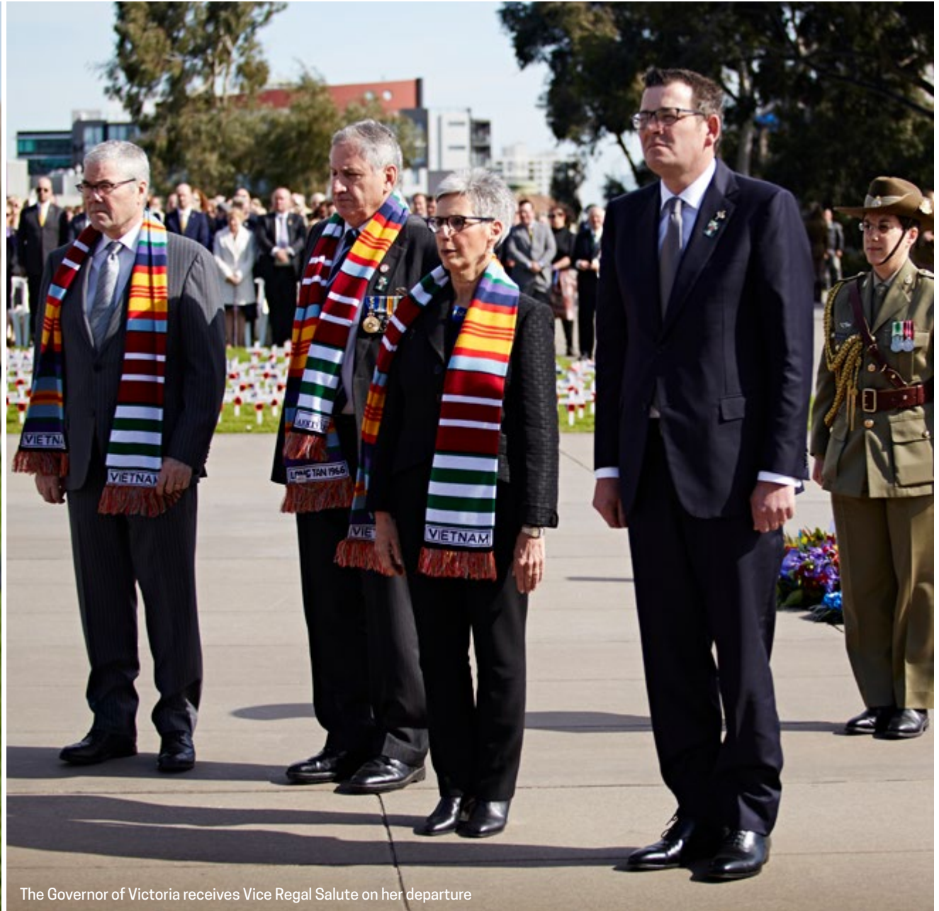
The Governor of Victoria receives Vice Regal Salute on her departure