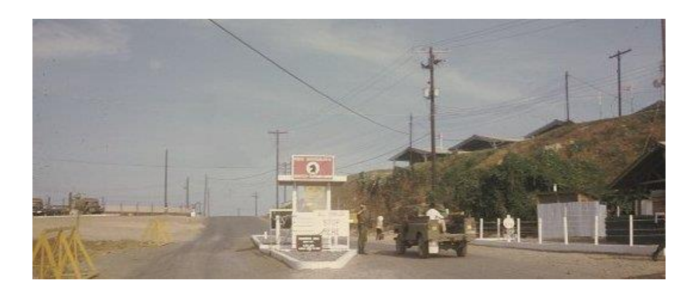
Story 2 – New Commander takes over 1ALSG

Aha say the bosses, all will work together and make the place spick and span.