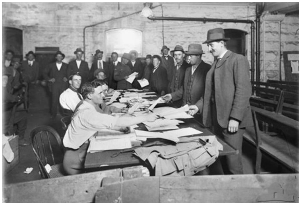
Military recruitment in Melbourne

Given the level of pro-war indoctrination in the schools, it is unsurprising that hundreds of under-aged Australian boys enlisted illegally in the AIF, some of them as young as 14.