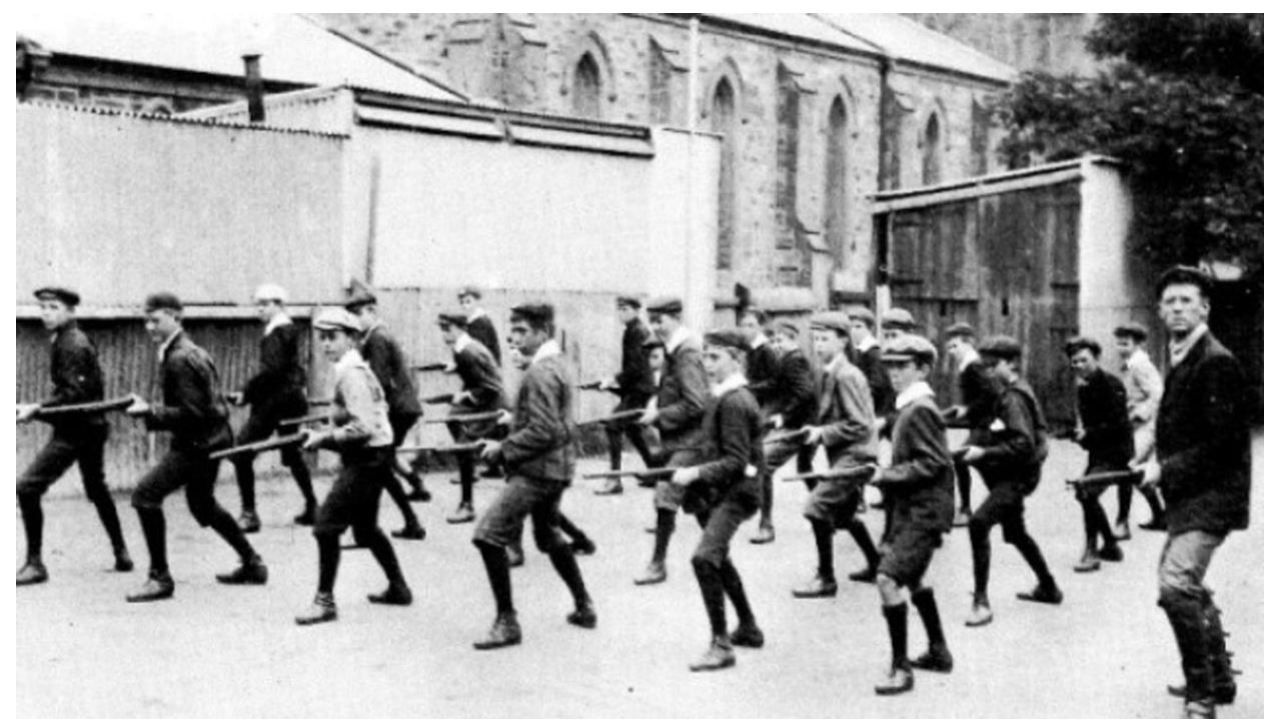
Pulteney Grammar School, South Australia, cadet unit training, circa 1911

Soldier Boys ' author explains that the major force behind the establishment of the mandatory cadet system was the Australian Labor Party. Prominent Laborite William Morris (Billy) Hughes, who was to become wartime prime minister, had been agitating for a form of military conscription as early as 1901, and members of the Labor Party were prime movers in an unsuccessful attempt in 1903 to establish the compulsory military training of all boys aged 14 to 17.