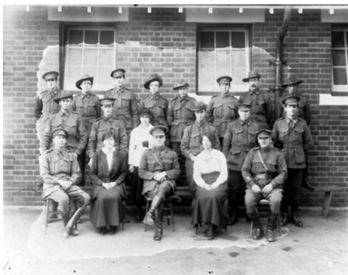
Portrait of Mont Park Hospital, CO and administration staff, circa 1919, Australian War Memorial, DAX2443.