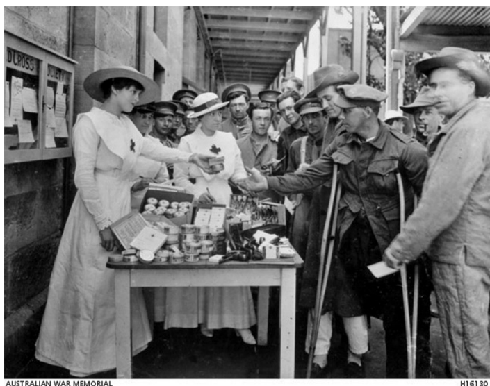
Ladies of the Red Cross Society distributing comforts to wounded men at No 4 AGH, Randwick Military Hospital, later known as the Prince of Wales Hospital, Sydney, NSW

Accordingly, the Red Cross Society was also involved in advocating on behalf of soldiers who were hospitalised in Mont Park Military Mental Hospital and in Bundoora, after concerns had been expressed by family groups such as the Fathers Association, about the living conditions of 100 men grouped together with 'various stages of mental affliction'. [51] The society constantly responded to requests for provisions of items such as slippers, pillowcases, and use of a motor car, which transported patients on weekly visits to the theatre. [52] It also offered to donate additional gramophones and provided a woodwork teacher for patients' use. [53]