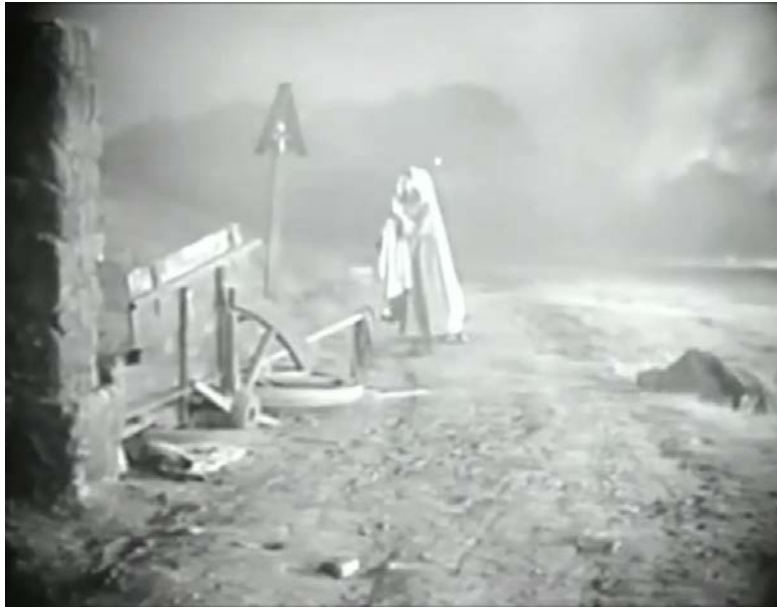
Fig. 4. Lillian Gish's Girl as the ghostly bride searching the decimated landscape for her fiancé.

Griffith uses the shell bombardment to test the mental fortitude of his two central characters, and we witness two very different reactions that seem to be prescribed according to the perceived characteristics of their genders. In Hearts of the World , shell shock is the domain of the female and not, as it is in The Battle of the Somme , of the feminised male. How does this work in terms of the film's purpose, as propaganda? In one way, the theme of war's psychological pressures is just another cog in the film's anti-war machinery. Its overarching aim to show, in the film's words, "another side to war" besides "brass bands and clanging sabres" encompasses the depiction of various horrors – the death of the Boy's mother, who must be buried by her young sons; the mistreatment of the Girl – with shell shock among them. There are other subtexts at work, however, in its representation of gender. Knowing the protagonists only as the Boy and Girl – as symbols of their genders rather than individual characters – suggests a universality of the love that conquers all evil. Yet it also draws a very clear dividing line between them. With the labelling of shell shock as a female malady, and the Girl's capitulation in reaction to the stresses of war, the responsibility – and glory – of achieving victory is placed in the hands of the mentally resilient and heroic male. Both are used to the film's advantage – a two-pronged approach that attempts to elicit in its audience sympathy for