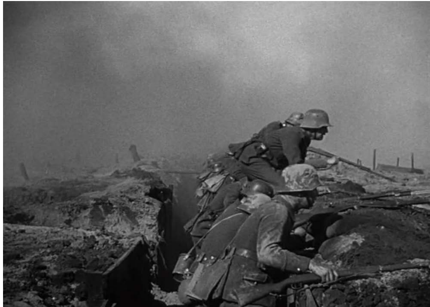
Fig. 6. The visual purgatory of the trenches in All Quiet on the Western Front .

blanketed in mist: for them and us, optically and psychologically, little else exists in these moments save the devastated landscape of tangled mud, bodies, and barbed wire (Figure 6).