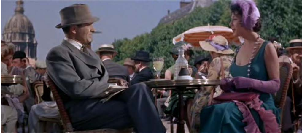
Fig. 8. Jake Barnes' sense of alienation from the vibrant city and society of interwar Paris is given visual life in The Sun Also Rises .

reveals this side of his sexuality. 62 The prostitute is only one of two significant examples of these women in The Sun Also Rises , both of whom represent an emblem of cultural modernisation, the emancipated New Woman. The other is Lady Brett Ashley (Ava Gardner).