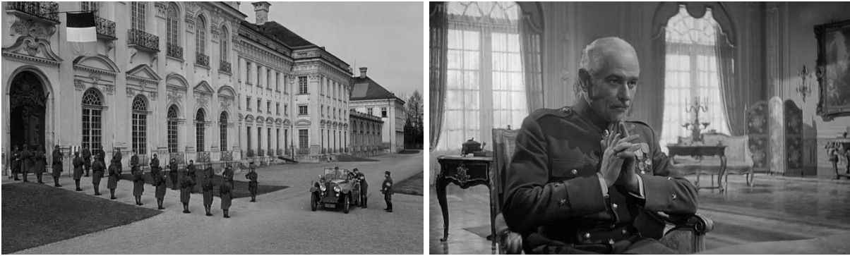
Fig. 9. Left: The villain's lair – Mireau's opulent headquarters. Right: Interior and the archetypally villainous General himself.

to accentuate the suffering etched into his features. He has a wife, but he's "never going to see her again, I'm going to be killed." The man is "a bit shell-shocked," says his sergeant, but according to Mireau, there is no such thing: he is just a coward, a "baby," who must immediately be removed from the regiment lest he "contaminate" his comrades. Between them, the General and his aide-de-camp , Major Saint-Auban (Richard Anderson), refer to all three of the common characterisations of the shell-shocked man – as infantilised (Mireau calls the traumatised soldier a "baby," above), feminised ("If a man's a ninny, let him put on a dress and hide under the bed"), and bestial or inhuman ("they get in a tight spot under heavy fire, gang up every time ... herd instinct I suppose, kind of a lower animal sort of thing"). This dismissal of shell shock was prevalent, as we have seen, among those higher in the military hierarchy, especially in the early years of the war. It is exaggerated here, exploited as one facet of the film's wider depiction of a 'gulf between leaders and led' around which its indictment of war is structured. 20