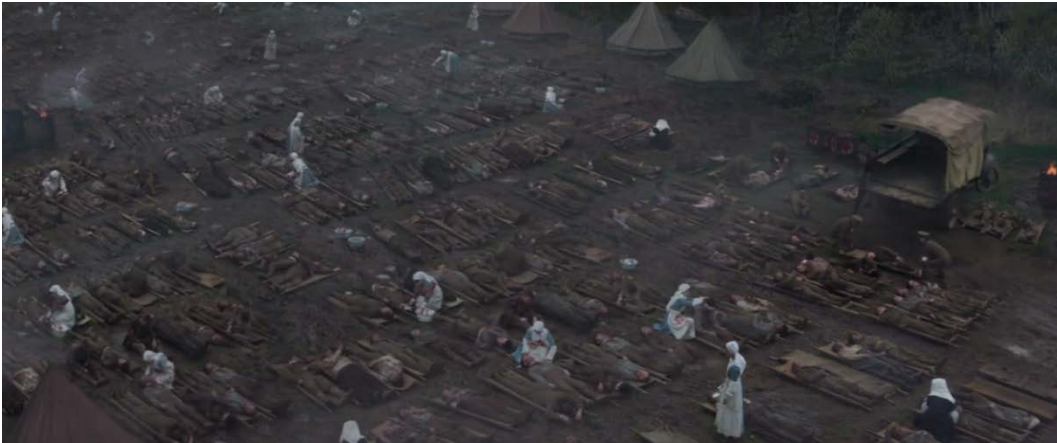
Fig. 11. Testament of Youth evokes Gone With the Wind 's famous crane shot in illustrating the sheer scale and unmanageability of wounded with which Brittain and the other nurses must cope.

The film certainly draws parallels between Brittain and the shell-shocked man, although it shies away from representing much of the more explicit allusions to the psychological consequences of her war service that the real-life Brittain made in her memoir. 26 In interpreting the figure of the shell-shocked woman, it is impossible for the film to turn to the feminine “other” – by far the most common filmic mode of representing such a figure, as we have explored in a number of films so far – to illustrate her condition. Nor can it portray her transformation as masculine, since it is its very breakdown from which war neurosis emerges. The film relies, then, on more unconventional approaches to illustrating Brittain's trauma – though none we have not seen before. One might recall All Quiet on the Western Front 's Kat telling the new recruits to bury themselves, bestially, deep into the earth, into Mother Nature – in order to manage their fright when under bombardment – as Vera does the same, on her hands and knees, pressing her hands into and covering her face with mud, upon hearing of the death of her brother.