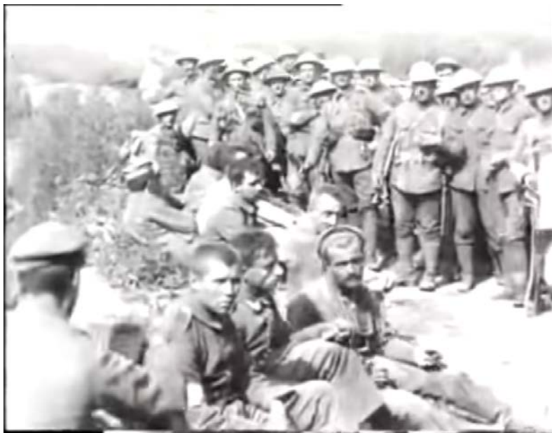
Fig. 2. British Tommies dominate their German captors in The Battle of the Somme .

Shell shock is consigned somewhat to the margins of The Battle of the Somme , evident to any significant degree in just one brief sequence of its 77-minute running time. From it, however, we can draw a fair amount of subtext. It begins with an intertitle: “British wounded and nerve-shattered German prisoners arriving. Officers giving drink, and Tommies offering cigarettes to German prisoners.” We see two British soldiers pass the camera, limping, held up by their comrades. Then more Tommies, shepherding battle-worn German prisoners, some of