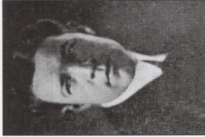
Edward McManus, pictured in The Moving Picture World magazine, December 27, 1919.

and depicting their "life, habits and tribal customs" in the territory set aside for a majority of the displaced tribes of the country—Oklahoma. 8