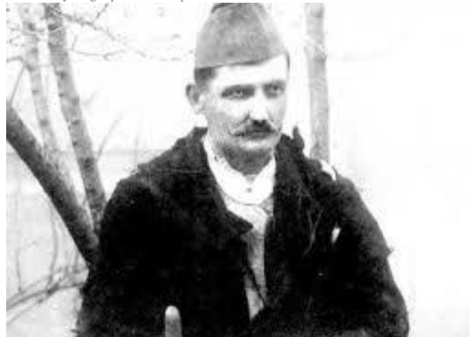
Below: A young Apis. source: public domain

-Anonymous friend of Dimitrijević, ca. 1915