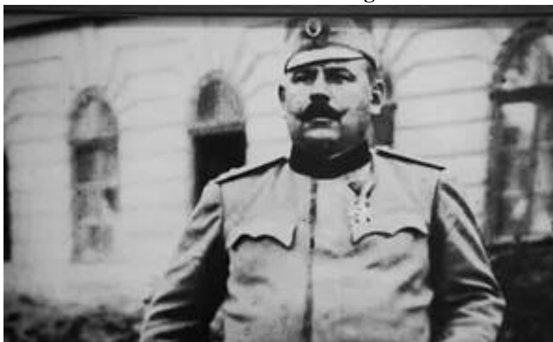
Above: Dragutin Dimitrijević

Members were seated in a dark room, with a knife to their back and a pistol to their head and told to recite the oath of secrecy: