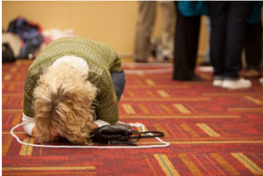
Woman at the Conference

Joni Eareckson Tada: Because all the speakers had an opportunity to stand in it. And of course, I had an opportunity to wheel inside that circle. May revival begin with me.