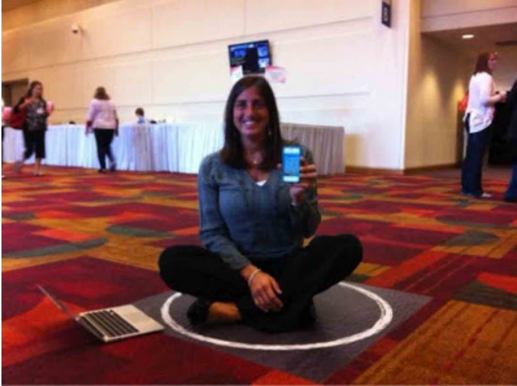
Participant at True Woman conference