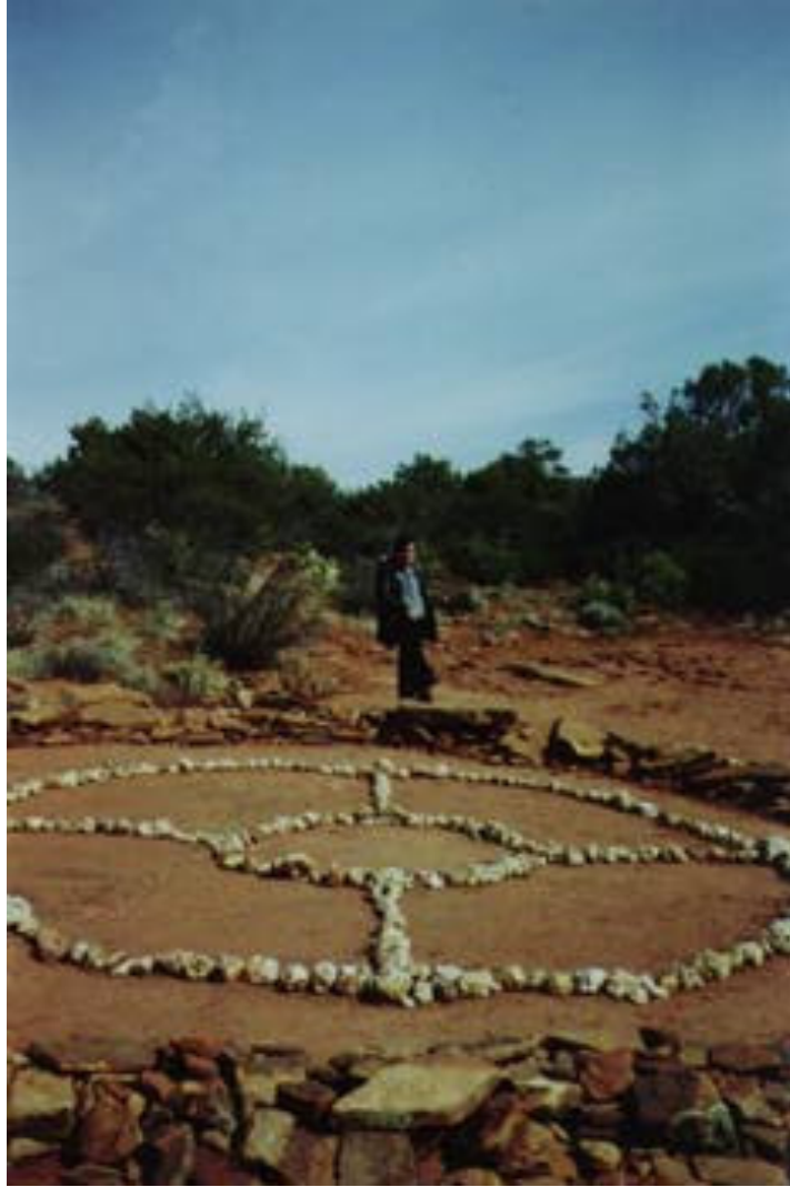
Druids prayed inside a sacred circle -