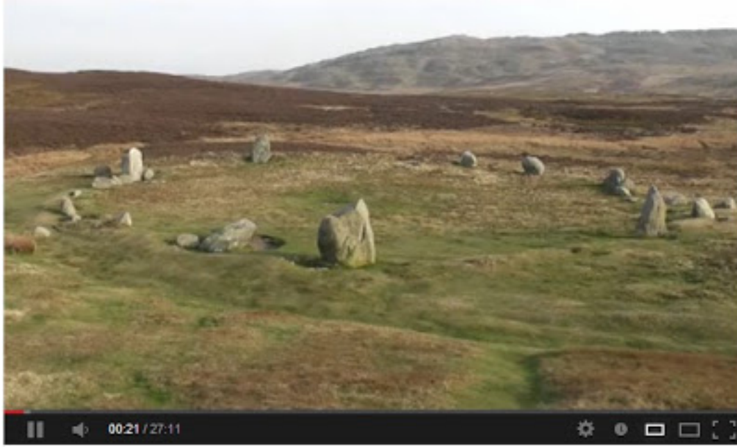
Sacred Circles - The Druids Circle - Penmaenmawr North Wales.