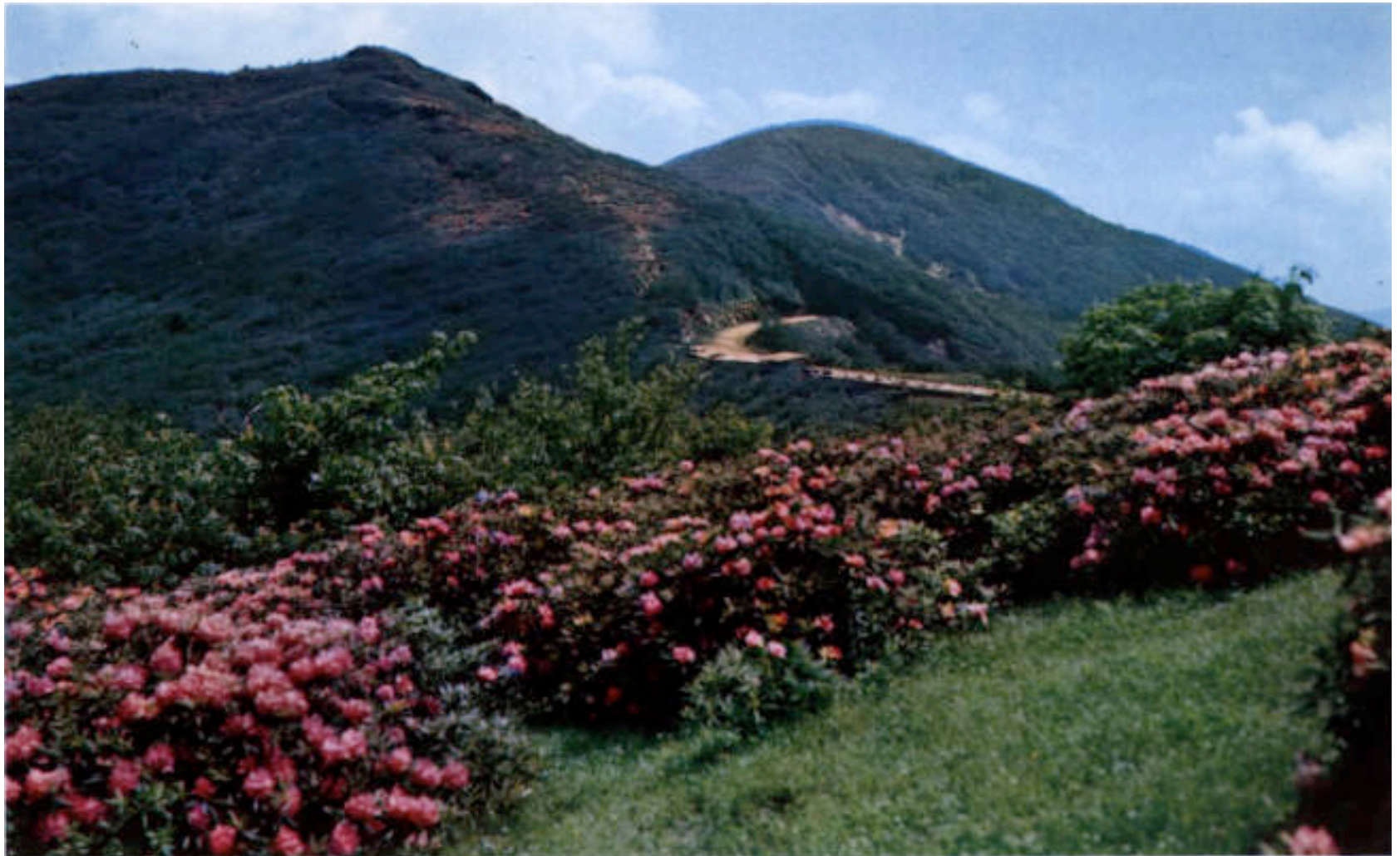
PURPLE RHODODENDRON— BLUE RIDGE PARKWAY