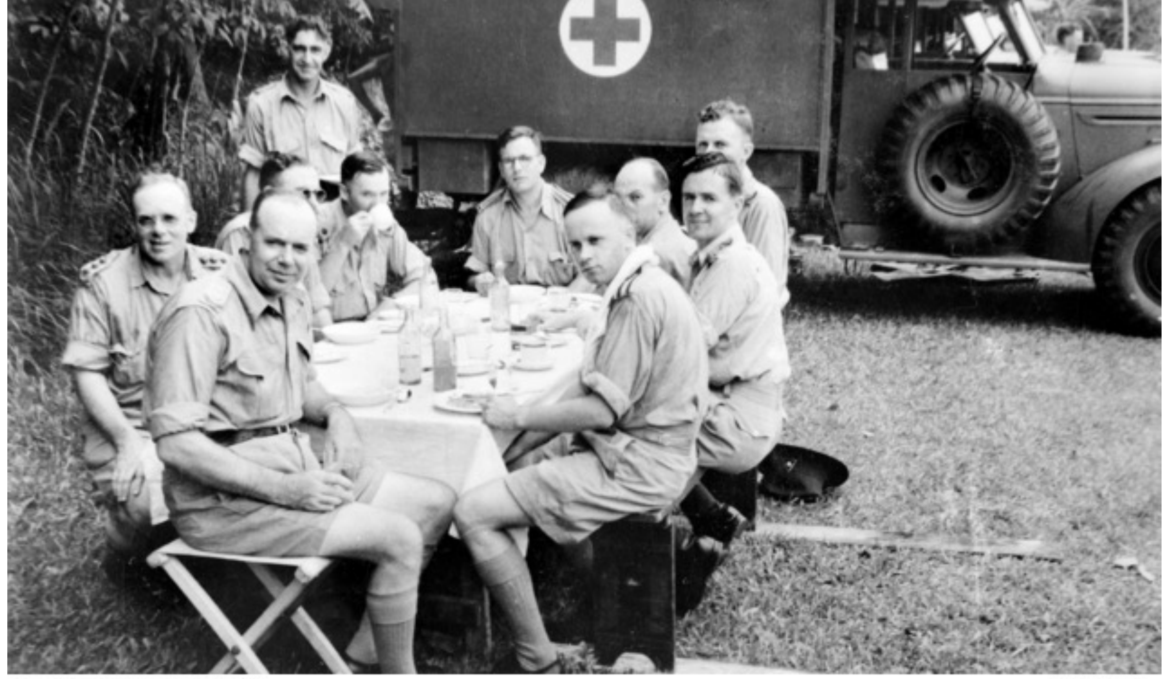
AUSTRALIAN WAR MEMORIAL