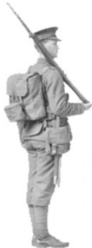
Ration Strength June 30 1916 1044