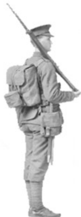
Combat Ready July 1 1916 929