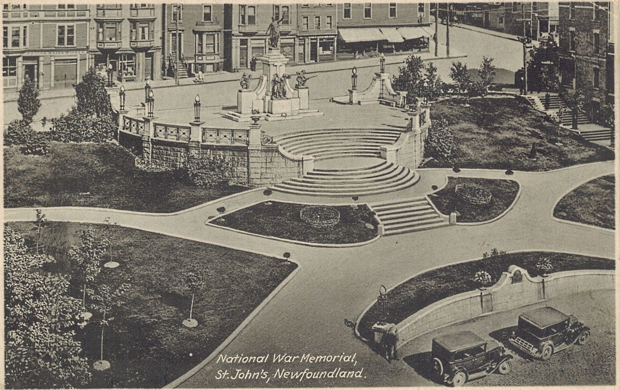
National War Memorial, St. John's, Newfoundland.