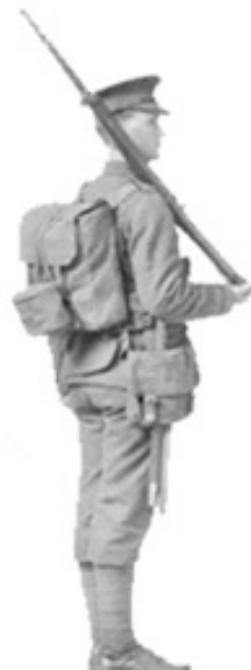
Attacking on July 1 1916 794