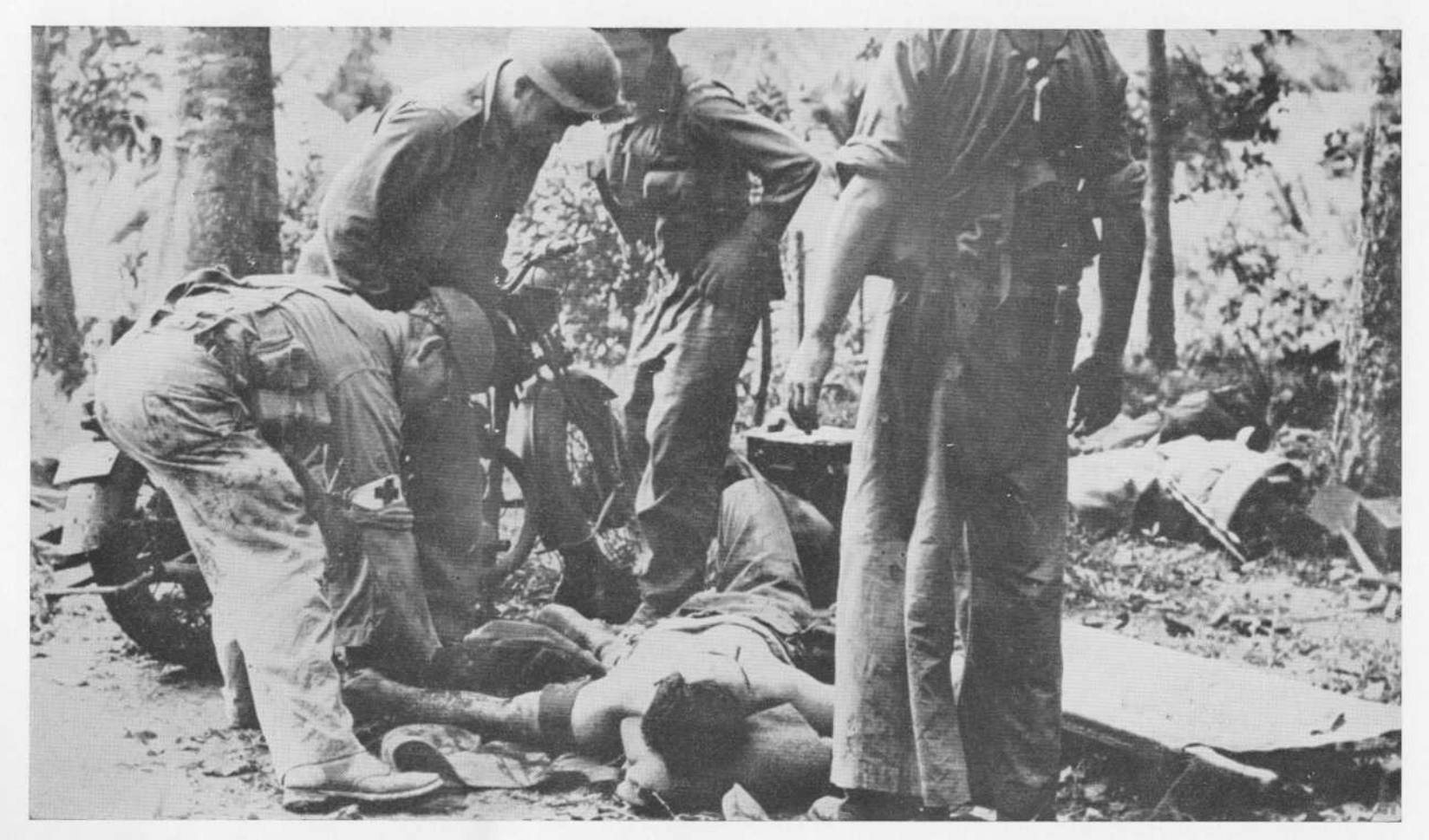
Attending wounded in action in Malaya.