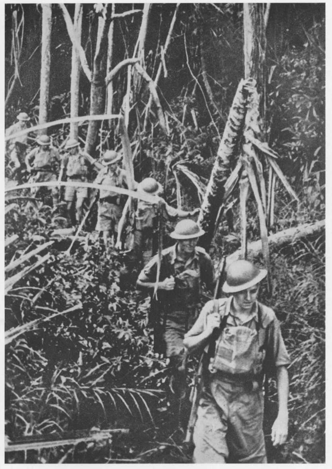
Australians train for jungle warfare Malaya.