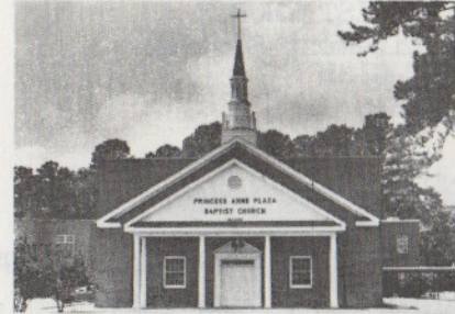
PRINCESS ANNE PLAZA BAPTIST CHURCH 245 Rosemont Road Virginia Beach, Virginia 23452