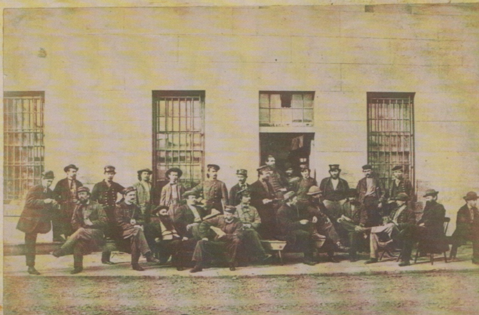
Confederate Naval Officers - Prisoners of war - Confined in Ft Warren - Boston Harbor