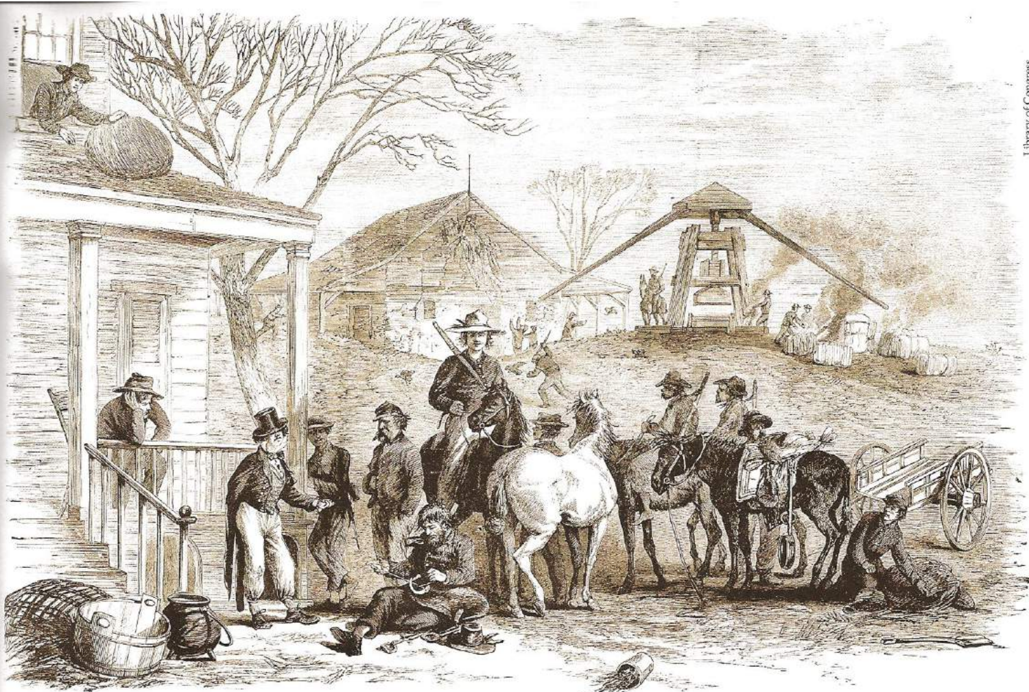
Bummers looting and pillaging a farm in South Carolina.