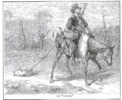
A bummer dragging a captured pig back to camp.

It is like some horrid nightmare. When I shut my eyes I see nothing but creatures and human beings in agony. The poor suffering horses! Some fortunately dead and out of their misery, others groaning in death pains, some with disabled limbs