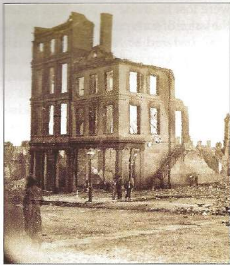
Ruins in Richmond, Virginia.

between two horses," recounted a friend who witnessed his death, "and dragged in plain sight of his agonized relatives to the open field of our town, where one man volunteered to do the killing, and ordered the helpless, dazed prisoner to stand up in front of him, while he emptied his pistol upon him." 35