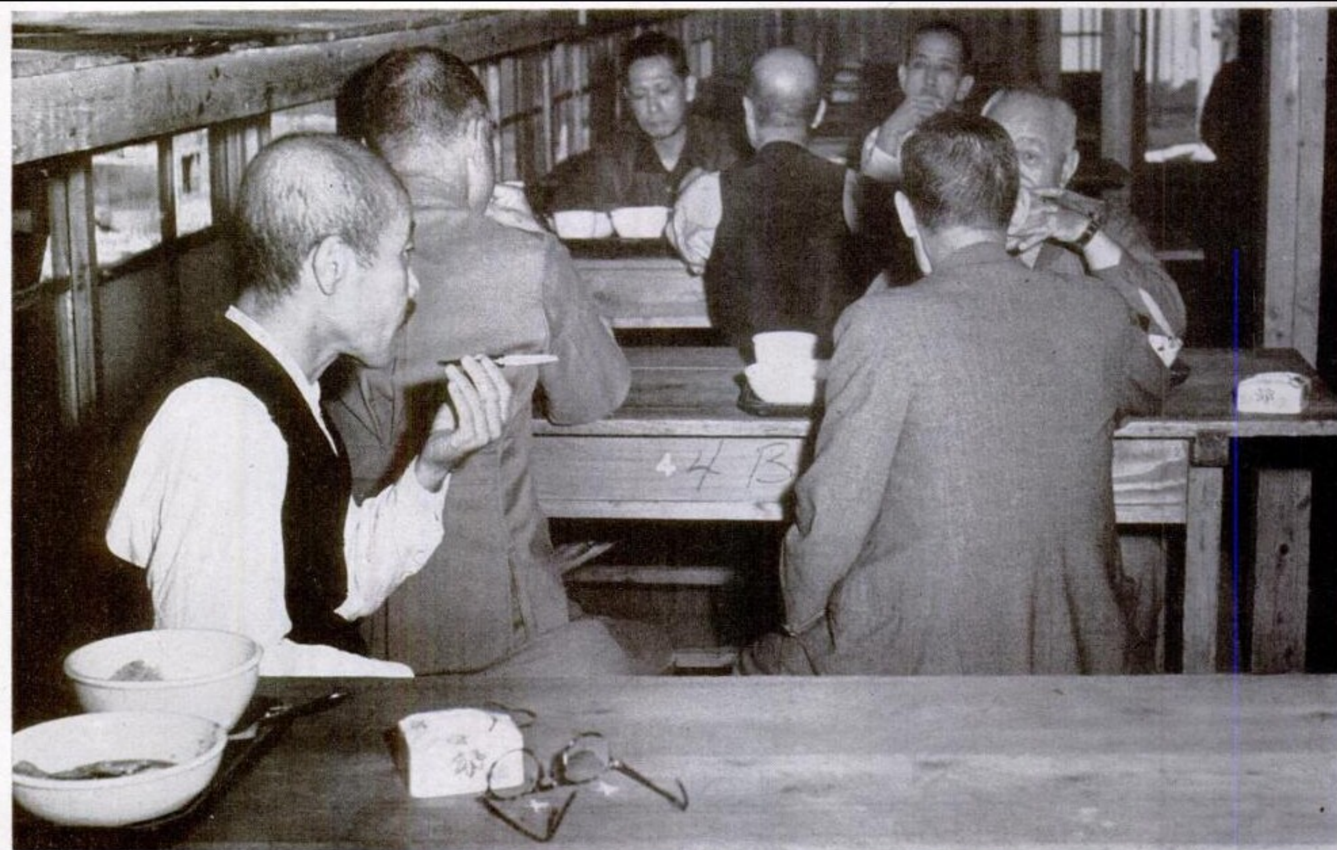
AFTER TOJO FINISHES LUNCH OF FISH, SOY BEANS AND RICE, HE TURNS TO STRIKE UP CONVERSATION WITH FELLOW WAR CRIMINALS. BUT NOBODY ANSWERS HIM