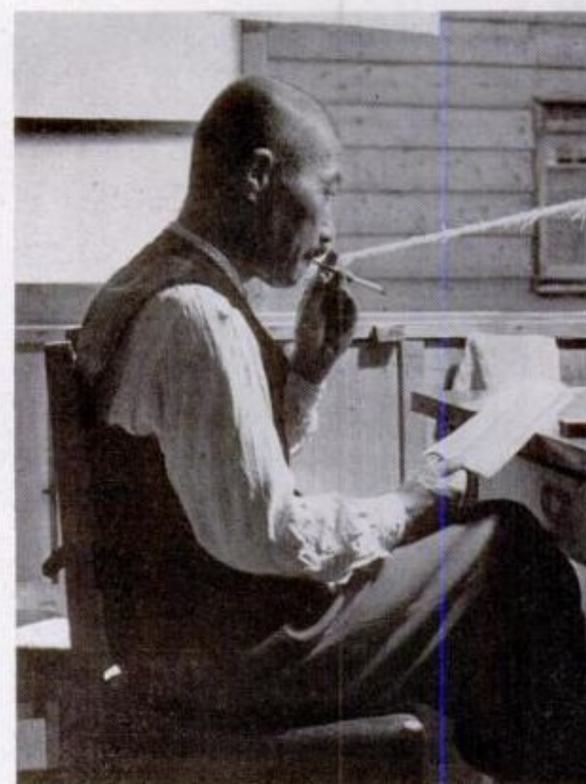
Writing his memoirs, Hideki Tojo spends his days largely alone in his tiny cubicle at the very end of empty barrack