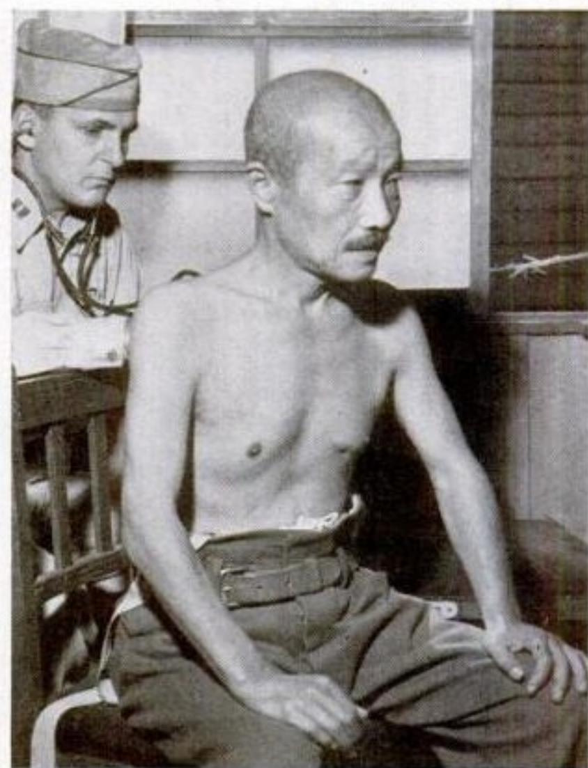
Physical examination of Tojo shows scar of the bullet wound under left breast. He weighs 94 pounds. Penicillin saved him.

Tojo has been given a physical examination every day and has gained a few pounds since his arrival in October at the camp. He willingly posed for LIFE Photographer George Silk, saying, "I want to be a good loser." But, although other prisoners were willing (see 1/29), he refused to be photographed while taking a bath