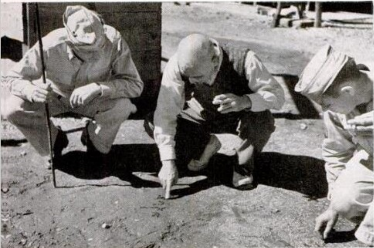
General Masaharu Homma, who threatened to kill General Wainwright and the 10,000 Americans who surrendered on Corregidor and gave the orders for the Bataan Death March, agreeably shows a GI guard how to write his name in Japanese characters in the prison courtyard.