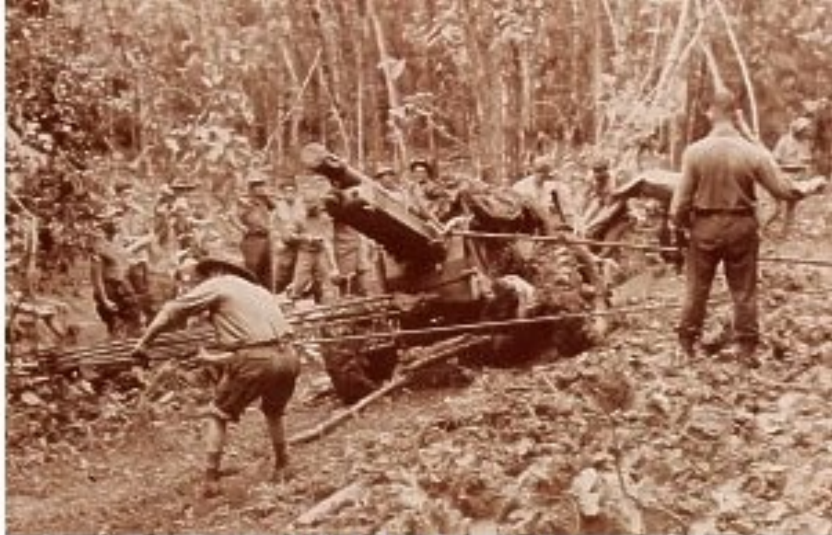
25-pounder guns of the 14th field Regiment Royal Australian Artillery being pulled through dense jungle near Uberi on the Kakoda Trail September 1942