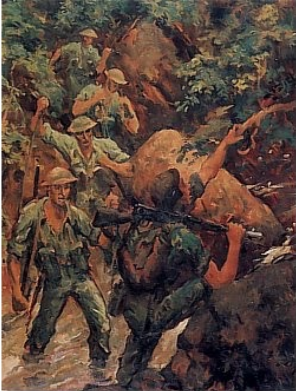
Australians on the Kokoda Trail.