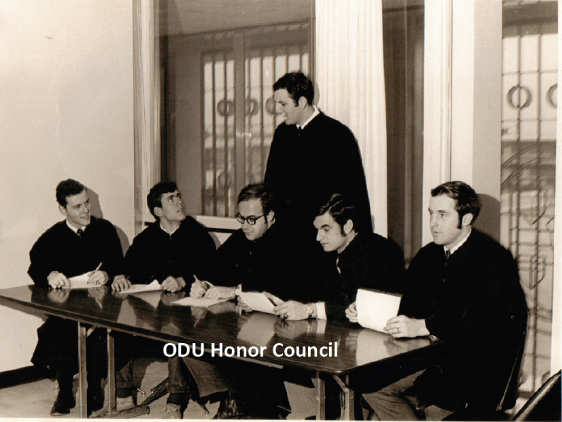
ODU Honor Council