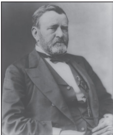
Figure 1: Ulysses S. Grant as President