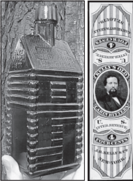
Figure 3 (L): Old Cabin Bitters Bottle Figure 4 (R): Kelly's "Proprietary" Revenue Stamp

peaked roof. It is a Kelly's Old Cabin Bitters [Figure 3]. Examples have sold to bottle collectors in recent months at prices approaching $2,000. Kelly was James B. Kelly of New York, a whiskey man, who is shown on a self-produced "proprietary" revenue stamp [Figure 4]. This is an ironic touch since it was an attempt to evade federal revenues on alcohol that lay at the heart of the Great Whiskey Ring.