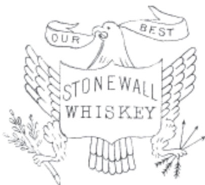
Figure 8: Stonewall Jackson whiskey ad

After the Civil War, both Southern and Northern generals were honored with their names on whiskey bottles. For example, General Stonewall Jackson, a Confederate leader killed in battle, had two whiskeys named for him. One, as shown in an ad here, [Figure 8] was "General Stonewall," a product of the B.B. Davies Company of New York City. "Stonewall Jackson" whiskey by contrast