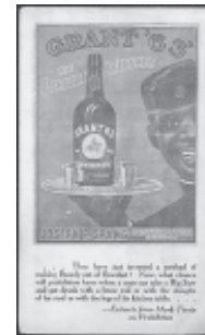
Figure 11: Grant 63 ink blotter

with a bottle of the whiskey on a tray with two shot glasses and praises the product as "The Perfect Whiskey."