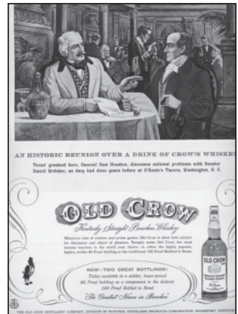
Figure 2: 1955 Old Crow Ad: Houston & Webster

Old Crow has always trumpeted its historical connections including depicting important figures as customers. The ad shown here [Figure 2] purports to show Texas hero Sam Houston sharing its bourbon with famous orator Daniel Webster.