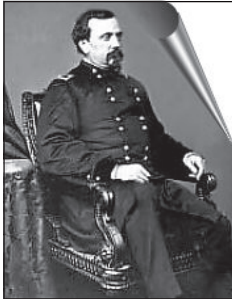
Figure 5: General Orville Babcock Sylph." This was the name given to her by one of the conspirators, General Orville E. Babcock [Figure 5], who also happened to be a White House aide, personal secretary to President Grant.