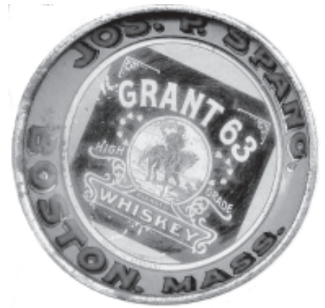
Figure 10: Grant 63 tip tray

with a bottle of the whiskey on a tray with two shot glasses and praises the product as "The Perfect Whiskey."