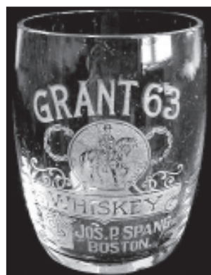
Figure 9: Grant 63 shot glass

The label on the bottle and items such as Spang's give-away shot glasses featured Grant, one of the best horsemen America ever produced, astride a prancing steed [Figure 9] There are loops of braided rope on either side and curlicues on the base. The glass also shows a frosted shield that holds a JPS monogram — representing Joseph P. Spang. A Spang tip tray [Figure