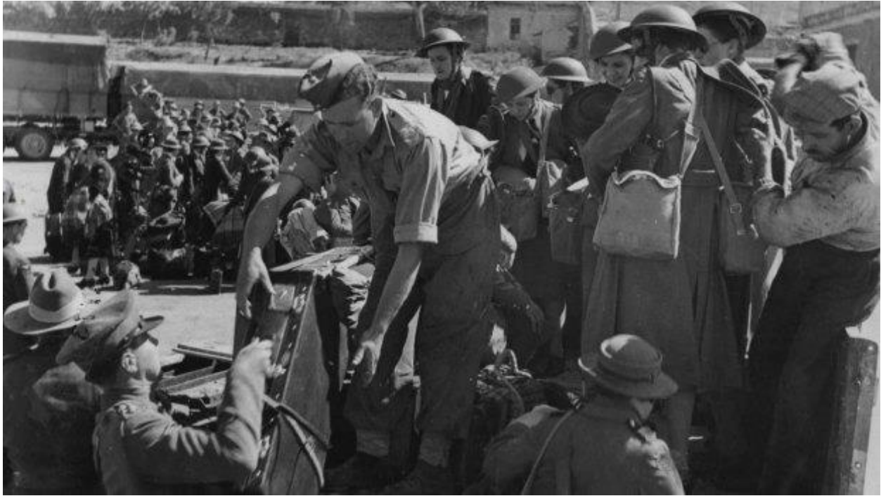
Australian and New Zealand hospital staff arrive on Crete after being forced out of Greece following German attacks, June 1941.