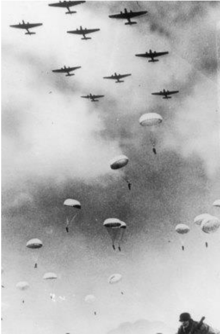
German paratroops land during the invasion of Crete.

In the morning the doctor returned and injected the Australian prisoners with a clear fluid. Over the next eight days the doctor examined the POWs every morning, taking detailed notes on their temperatures, aches and pains, and taking blood and urine samples. Through his pain and fever, Savage could see on neighbouring beds that at least two of his Aussie mates had a tube inserted into their stomachs through their throats. It wasn't clear to Savage whether the Germans were forcing something into their stomach or taking stuff out. Again, no medicine was administered, but the doctor frequently examined the Australians' eyes, taking detailed notes on what he found.