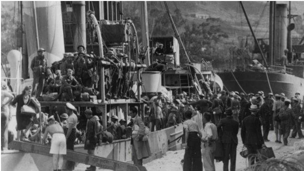
Australian and British soldiers on Crete in 1941.

Savage and fellow POWs were set to work mixing concrete at Rethymno Hospital on the north coast of Crete. Savage had been there just a few hours when a doctor arrived and stood watching the POWs work. After a while the doctor walked over and, with guards watching, approached Savage. The doctor told him to stand still, then examined his eyes, turning up his eyelids. The next day the same doctor returned and ordered Savage to go inside the hospital. The doctor then gave Savage a thorough medical examination, X-rayed his chest, tested his urine and took blood samples.