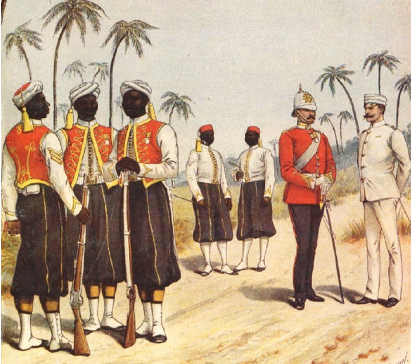
Soldiers of the West India Regiment

British Honduras proved to be an attractive choice for would-be expatriates. The New York Times , scarcely an unbiased observer, warned migrants they would find there “a worse climate, worse Governments, great lack of energy, no mechanical devices, untrustworthy field hands and labor, constant wars and overthrows of ruling powers, and loss of property, of health, of friends, and of the spirit of enterprise.” But proximity and common language made it appealing, and they arrived in numbers estimated upward from seven thousand,