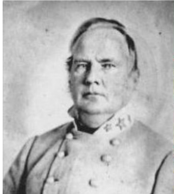
General Sterling Price

Maximilian, however, always appreciated honesty and had no anger toward Maury for telling him the truth. In fact, he was just as appreciative of an even more brutally honest assessment from one Confederate who stayed on quite a while after things were obviously going against the Emperor and that was the fiery General Joe Shelby.