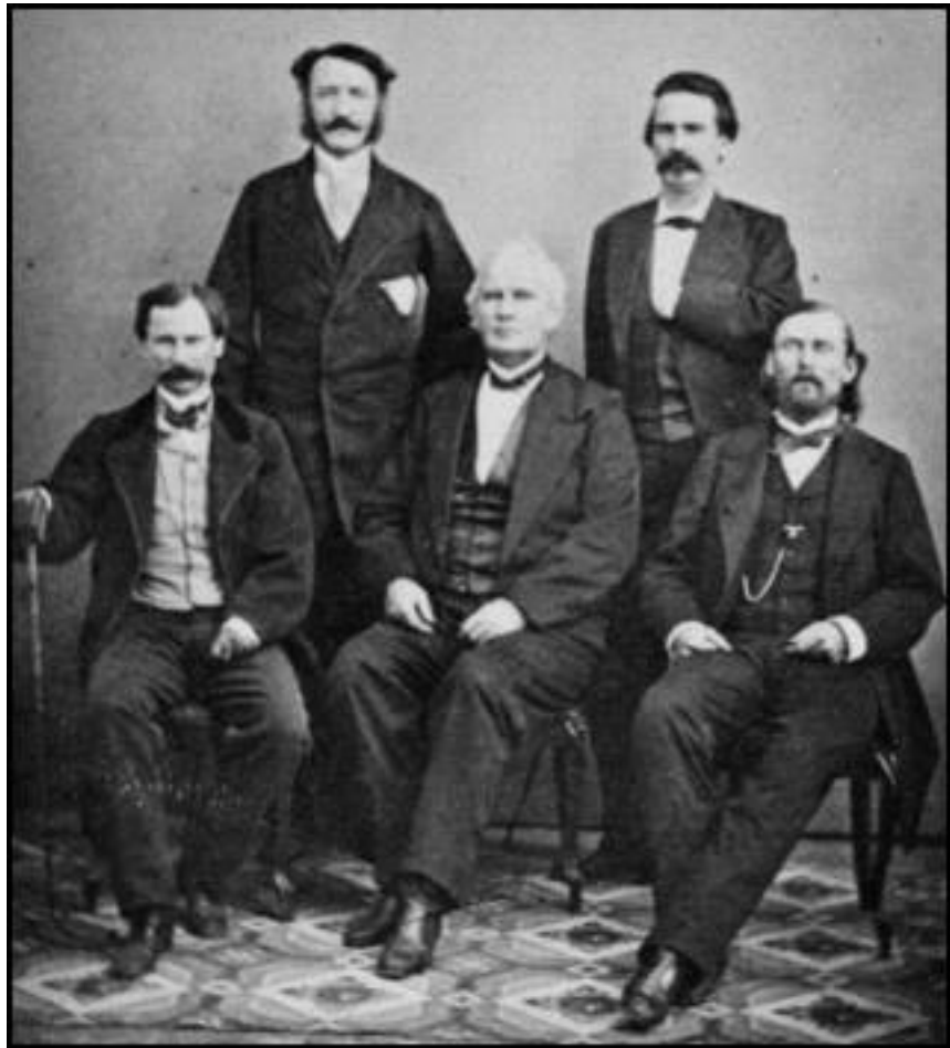
Confederates in Mexico (left to right) Isham Harris, John Magruder, Sterling Price, Joe Shelby and Thomas Hindman

Nonetheless, the U.S. made it clear from the beginning that they were totally opposed to the French intervention and would oppose any effort to establish a monarchy anyway in the New World.