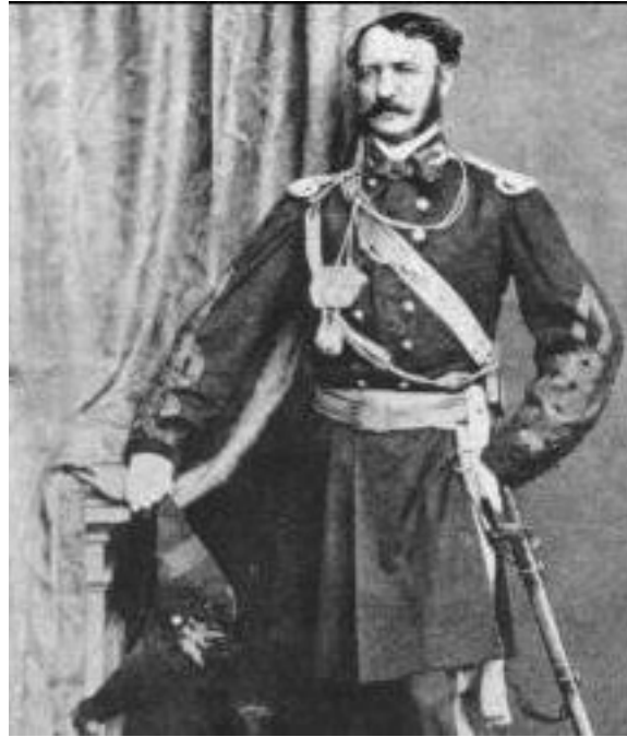
General John B. Magruder

When his appearance and clothing was commented on so favorably he advised other Confederates to follow his example and even Emperor Maximilian himself was dressing in the style made fashionable by Magruder. Soon he was given the rank of general with a staff position in the Mexican Imperial Army.