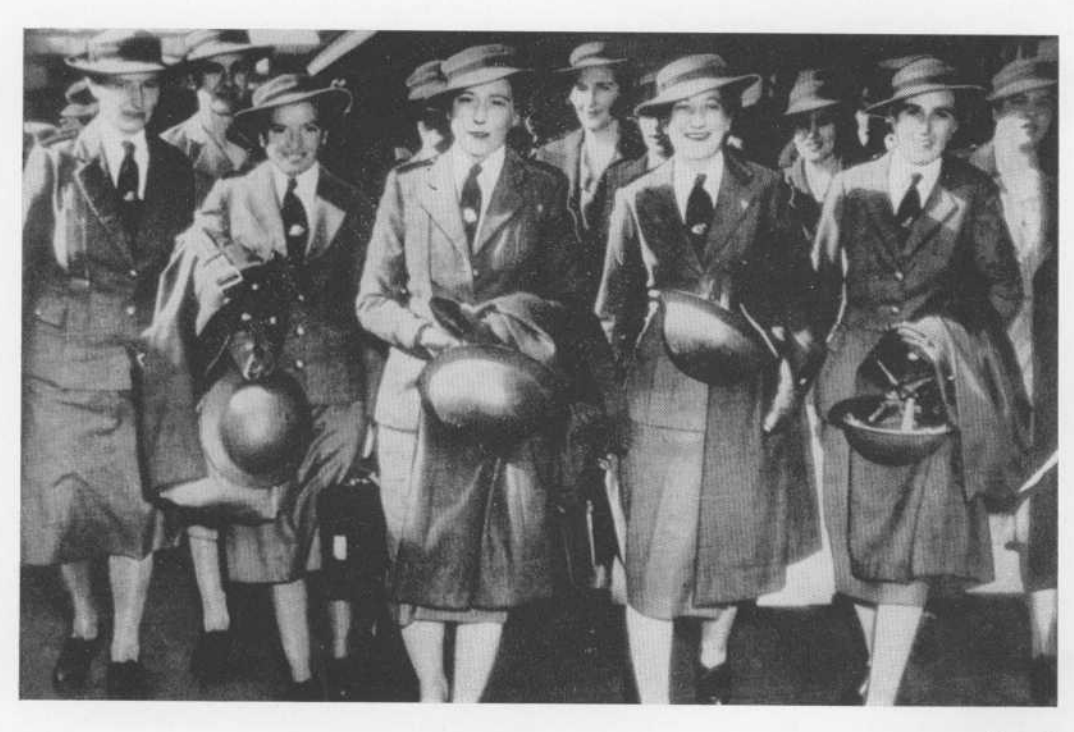
A.I.F. nurses returned from Singapore, March 1942.