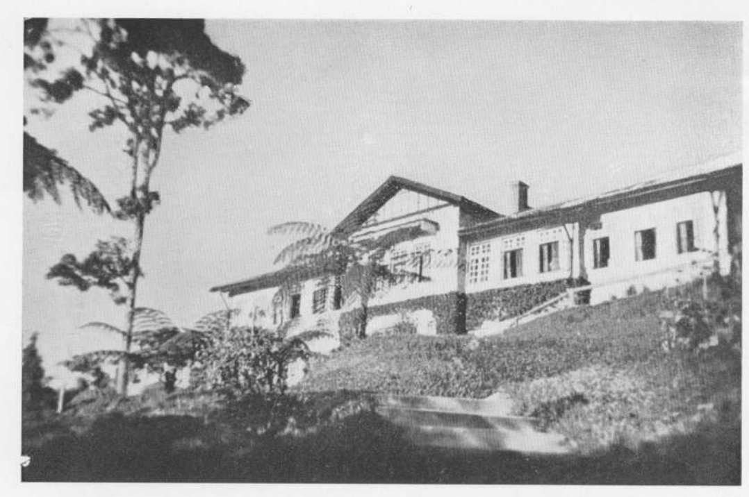
The 2/4th Casualty Clearing Station, Fraser's Hill, Malaya.