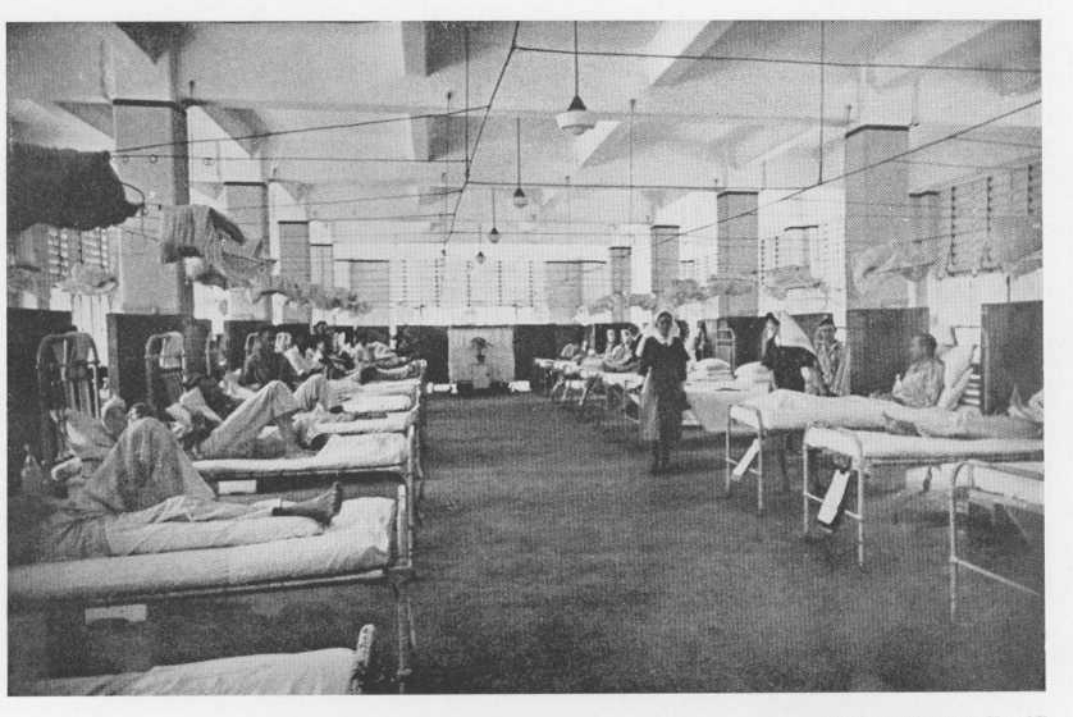
A.I.F. ward in Malayan Hospital.