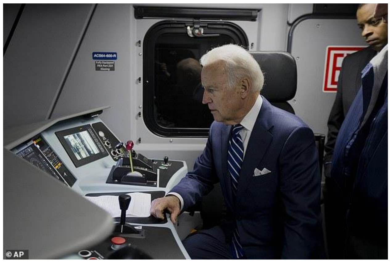
Biden is seen touring an Amtrak train in 2014. He recalled an incident that occurred around 2014 or 2015, but the conductor he named retired in 1993