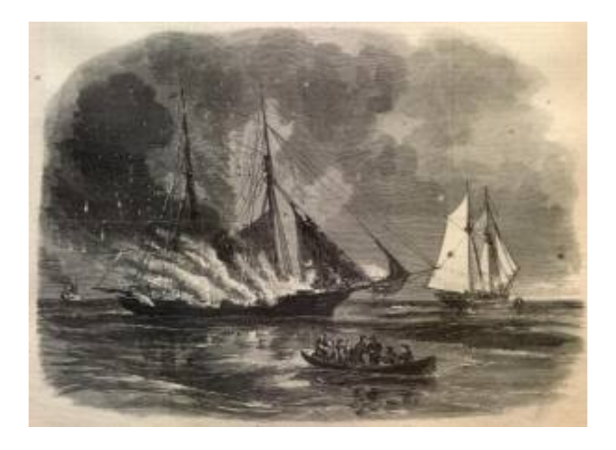
The "Caleb Cushing" burns in a print from the July 11, 1863 edition of "Harper's Weekly".