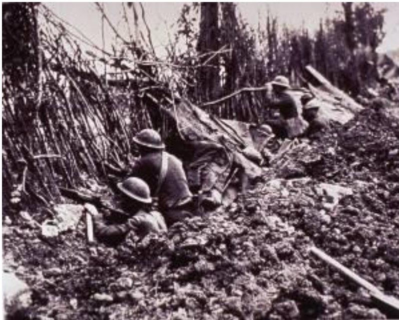
132nd Infantry in front-line

By Matthew Stibbe ~National Library of Medicine