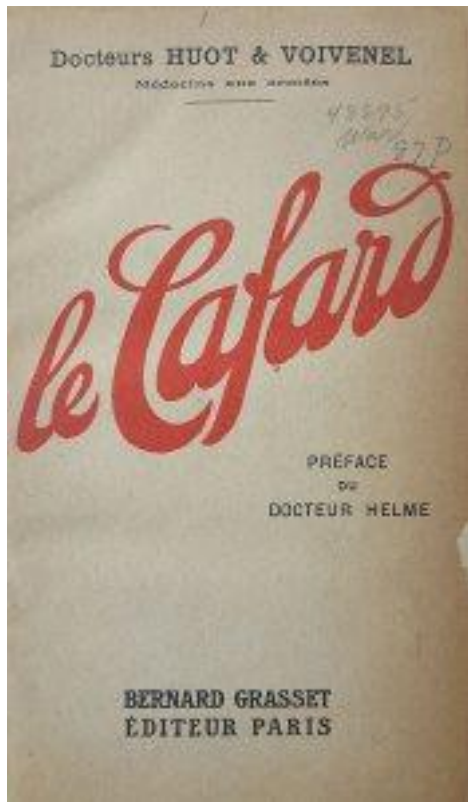
Le Cafard , 1918

by appropriating and medicalizing it, he also took control of its cultural meaning. He did so in a way that was certainly not intended to dehumanize the prisoners, or reduce them to ‘abnormal’ types governed by ‘deviant’ neurological impulses. In fact, he was very careful to distinguish between war prisoners and criminals. He compared the former to late nineteenth- and early twentieth-century polar explorers, heroic men navigating an unexplored, monotonous and hostile terrain. The camp, like the Arctic or Antarctic wilderness, was simply unsuitable for habitation by any human, at least for periods of more than a few months.