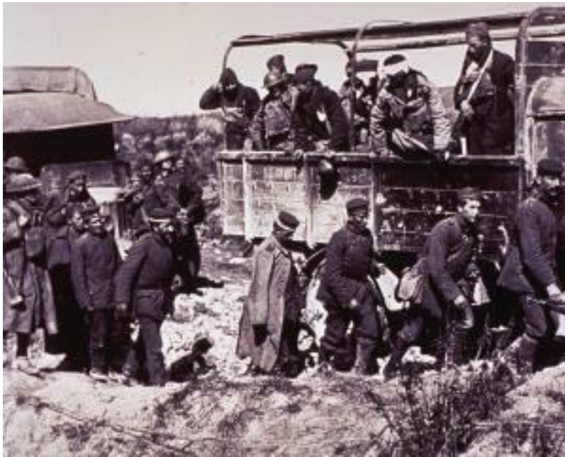
German prisoners near