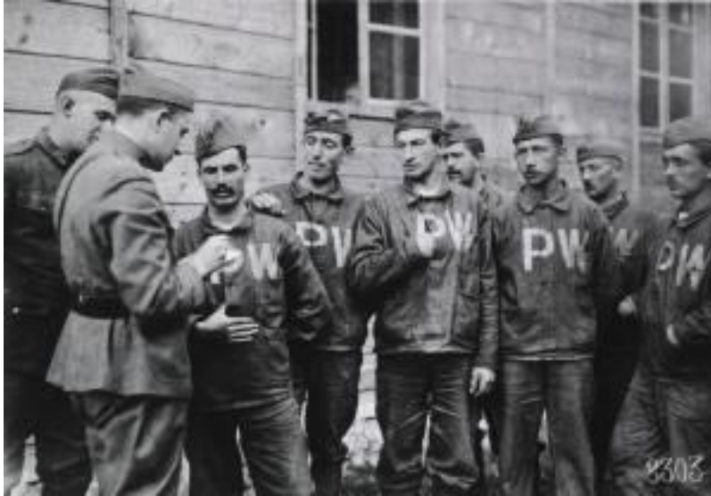
U.S. Army Base Hospital Number

7, Tours, France: Chaplain taking addresses of German prisoners to inform families, ca. 1918 National Library of Medicine #101396311