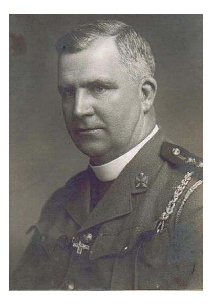
Figure 2. Photograph of Bishop Llewelyn Gwynne. By kind permission of the Trustees of the Museum of Army Chaplaincy, from the author's personal collection.